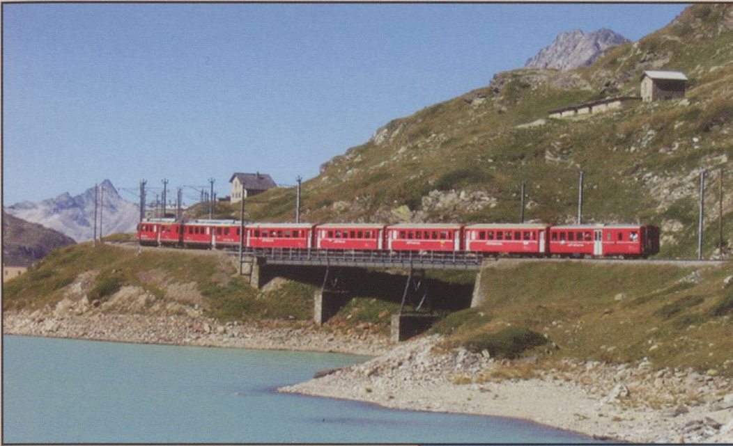
13. An RhB service skirts Lago Bianco on a north-bound Bernina service in September 2004.