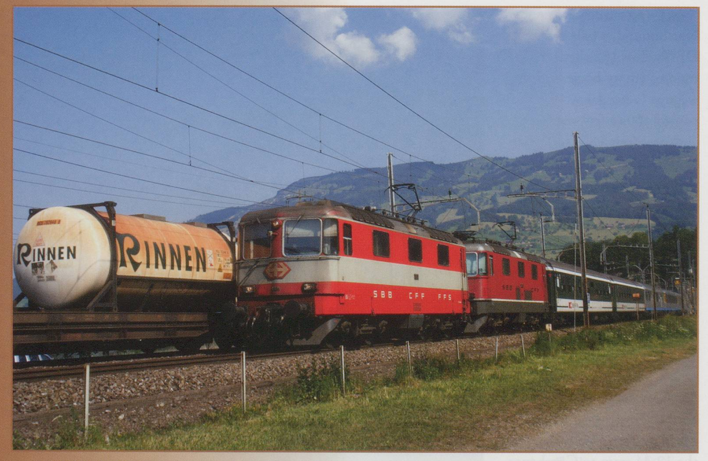
11109/11209 passing a northbound frieght with the 08.09 Shaffhausen - Venezia north of Schwyz.