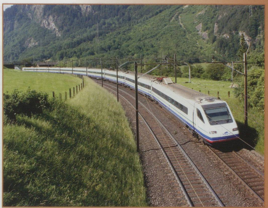
ETR 470007/57 withthe 07.10 Milano - Stuttart at Shüten.

I still have more places to explore on my 2007 visits and am pleased to note that the rumoured use of ICNs on some Gotthard line workings has yet to materialise and will not lead to a reduction in loco hauled IC trains on this route, and who knows what other open access operators may have appeared on the freight scene by then? I hope that the above information will inspire those that have yet to explore these locations. Wednesdays and Thursdays are the peak days for freight, Sundays and Mondays being the quietest, but the daily sight of pairs of Re4/4iis on passenger trains is no more, their Gotthard duties having been taken-over by single Re460s.