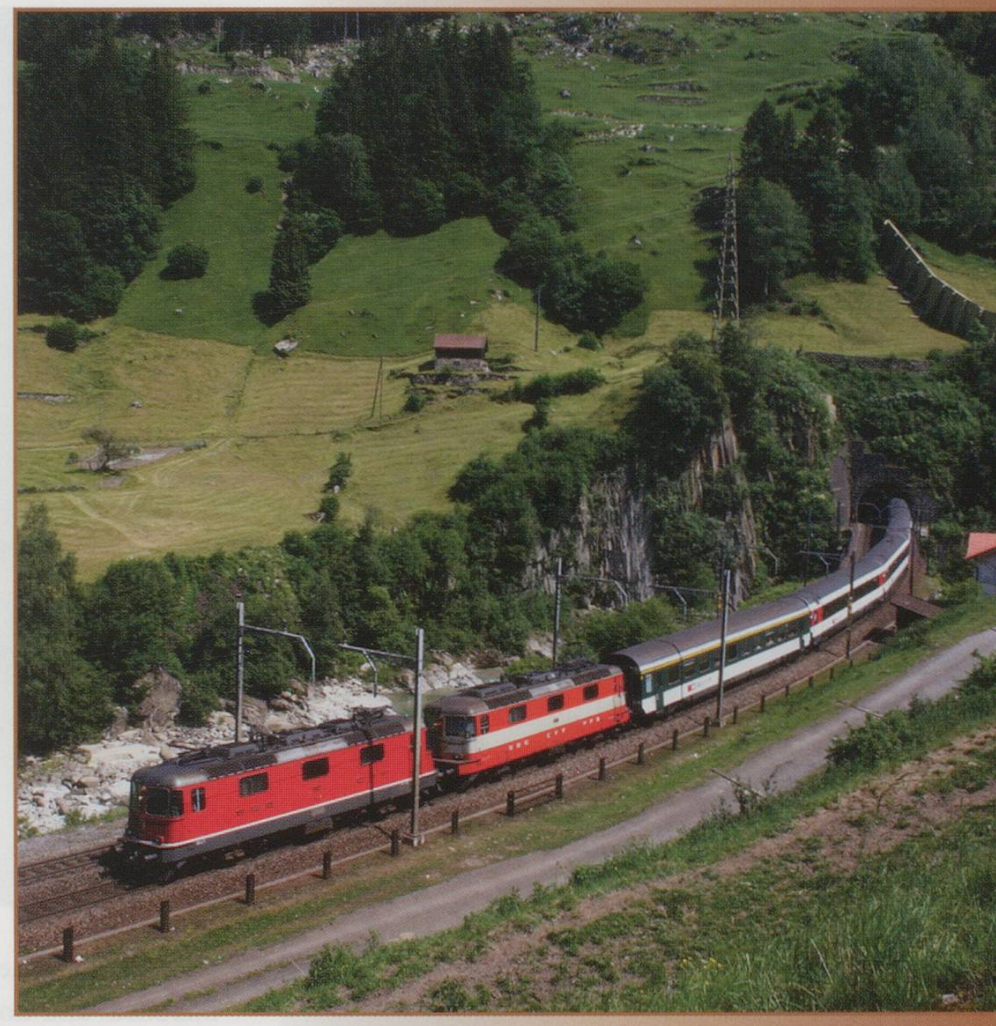
11157/11108 with the 12.25 Molano - Zürich at Wassen.

This is a good time of day here as Glacier Expresses abound (3 eastbound in an hour) providing several photo opportunities. Returning to Göschenen on the 13.28 I took the 13.45 bus to Wassen Bahnhof. I have since been told that the bus now only stops in the village at Wassen Post, a little further on, and it is therefore necessary to walk back past the Bahnhof to access the sharp left turn which leads down steeply, through a tunnel under the A2 autobahn, to the famous location of Wattingen curve on the lower level. Arriving at 14.00 I found lighting conditions suitable for shots in both directions until I departed at 16.15. Shots of southbound trains are probably better taken from a point where the Reuss River and the Gr. Windgällen (3rd. peak from the left in the distance – with Erstfeld lying on the valley