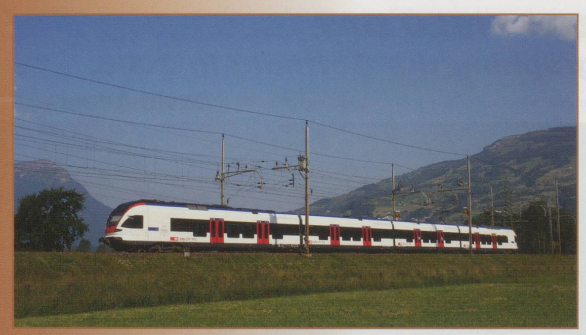
523004 passing through the neutral section with the 09.01 Erstfeld - Zug S2 service north of Schwy

Ae6/6 11461 heading south with a Sersa infrastructure train at Shüten.