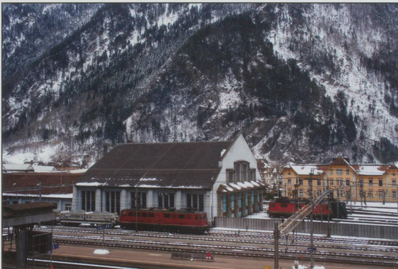
07.20 on 8th March 2006 - 11429 with a stone train for Fluelen with 11166 behind the "wall" in the depot yard.