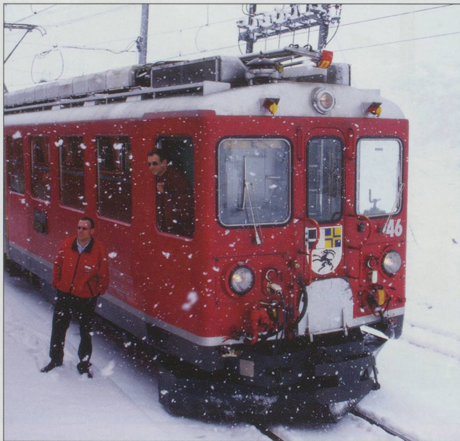
Sping Snow at Bernina Suot on 18/05/05.

Some SRS Members will know that in addition to enjoying and photographing Swiss railways I also present PowerPoint Presentations to raise money for CLIC Sargent, the children's cancer charity. One of these took place on the Friday evening of the 2007 Autumn Event at Kingsbury Episcopi. With photography and railways being joint hobbies I thought that these could link together in an interesting manner for Swiss Express .