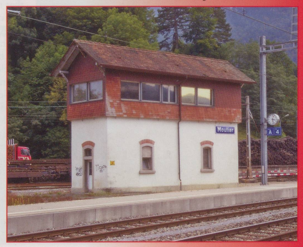
Moutier. There are two signal boxes at this location. This is the north box, where the lines to Basel and Solothurn diverge.