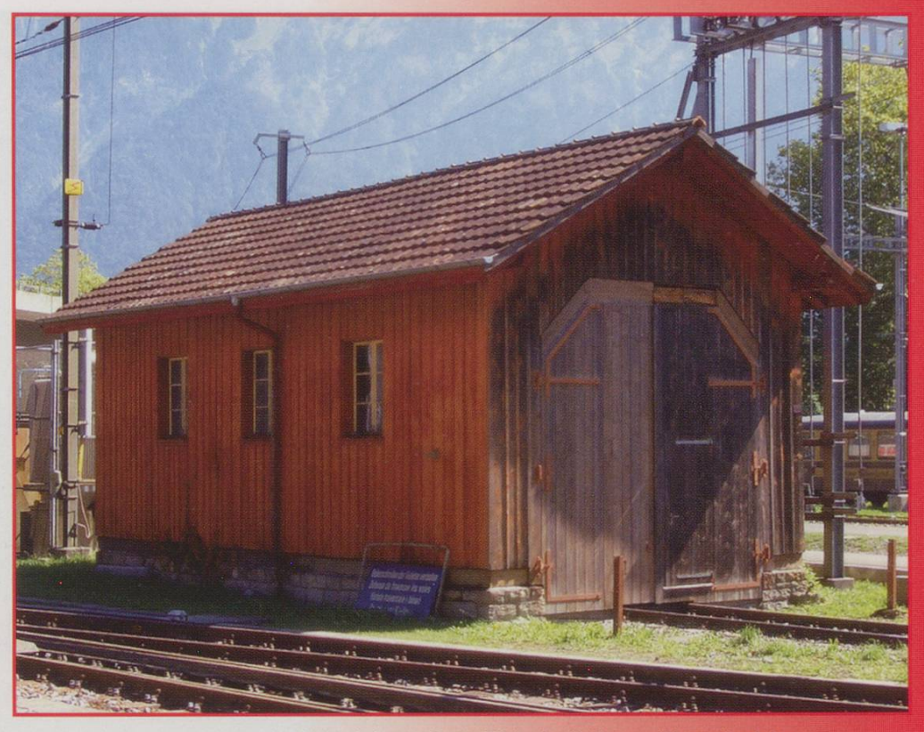
Interlaken Ost. This building will probably disappear in any future development.

series of exhibitions focusing on the development of the station and associated railway infrastructure. Alternatively, a photographic collection could perhaps provide the answer, with examples of the different styles and types of buildings found within the various railway companies' operating area being collated in order to form a lasting pictorial record, which might later incorporate the ground plans and dimensions of the featured buildings.