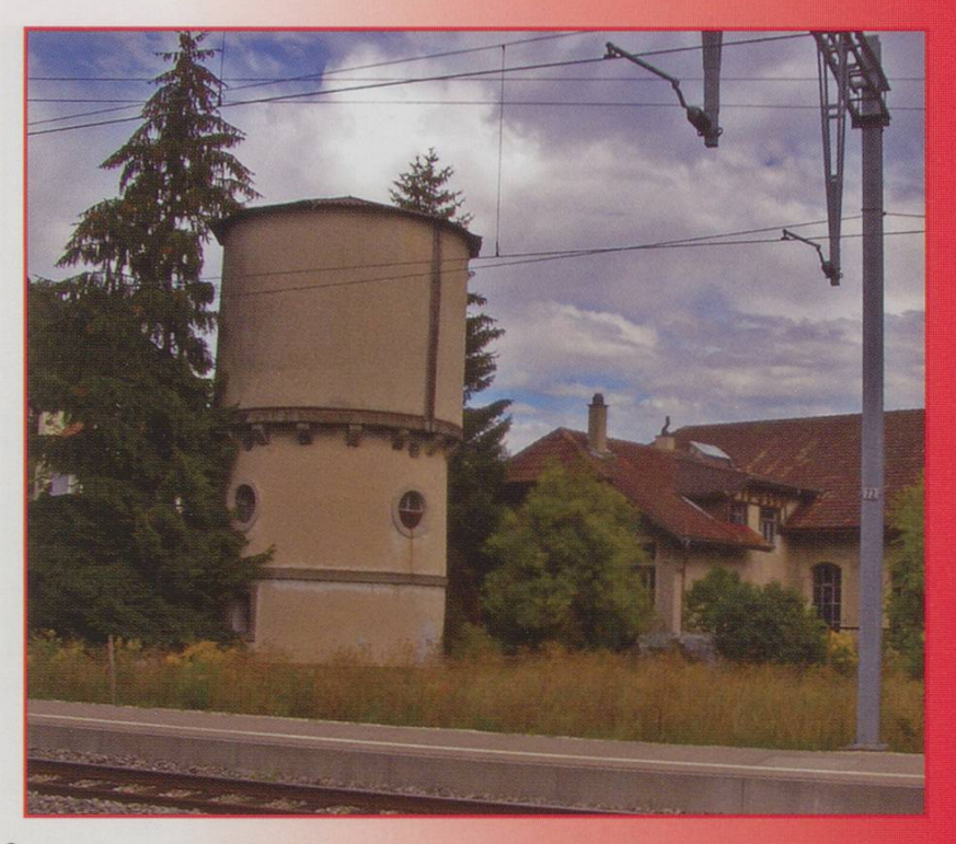
Moutier. The disused depot and water tower. What future do such buildings have?

Regular visitors to Switzerland will be aware of the continuing programme of improvements being carried out across the rail network, under the Rail 2000 banner. These works, although satisfying the indigenous population, the politicians and perhaps looking to a myriad of future European legislation, are themselves also helping to speed this process of change and many will probably have observed