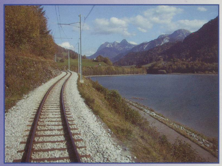
Has there ever been a better-maintained metre gauge line than the MOB?