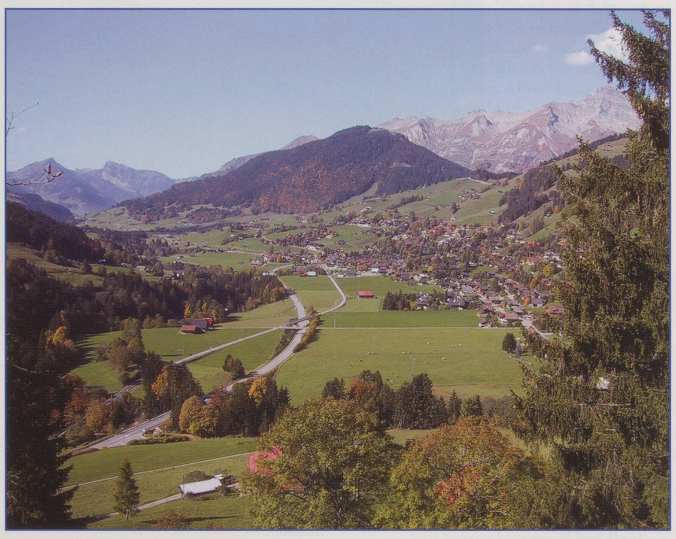
Panoramic view of Rougemont sitting peacefully in the valley floor.