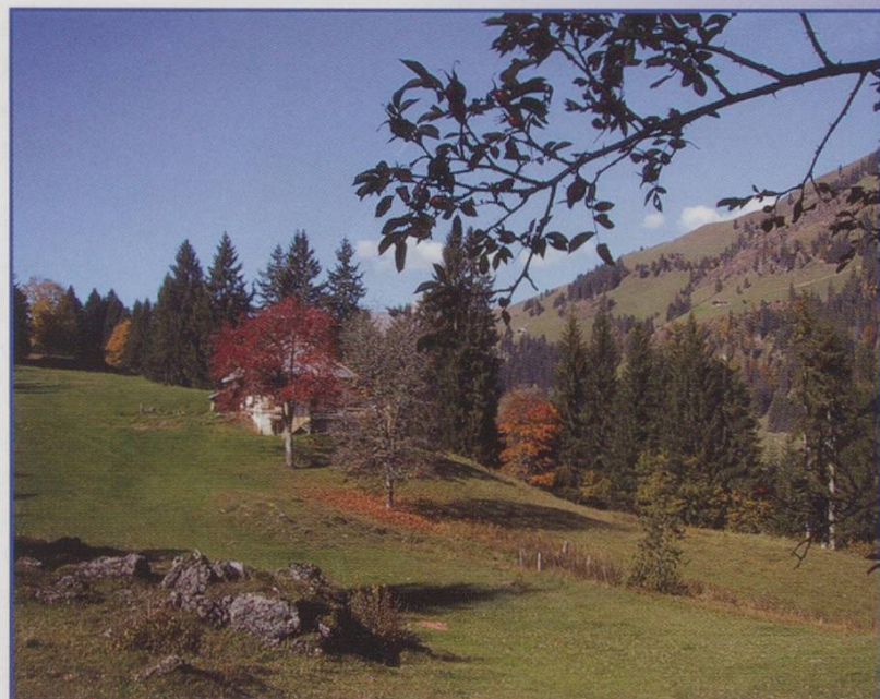
The wooded hills between Gstaad and Saanen.

to climb through wooded hills before emerging to a panoramic view of Rougemont sitting peacefully in the valley floor. Somewhere in these woods I had crossed from the German-speaking canton to the Frenchspeaking one. It was noticeable that the previously regularlyoccuring yellow 'Wanderweg' signs had now been substituted by occasional painted sticks stuck in the ground!