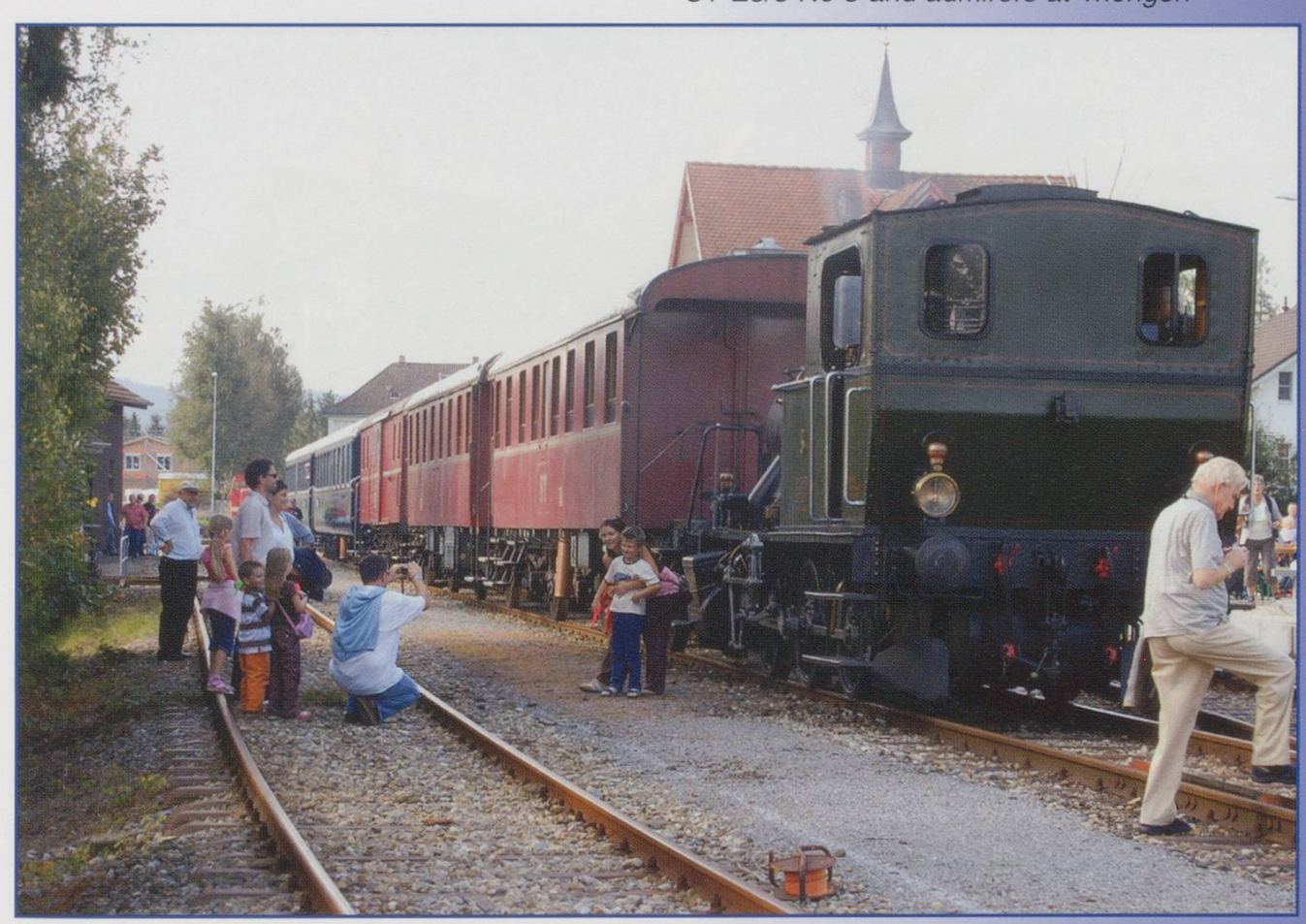
ST E3/3 No 5 and admirers at Triengen