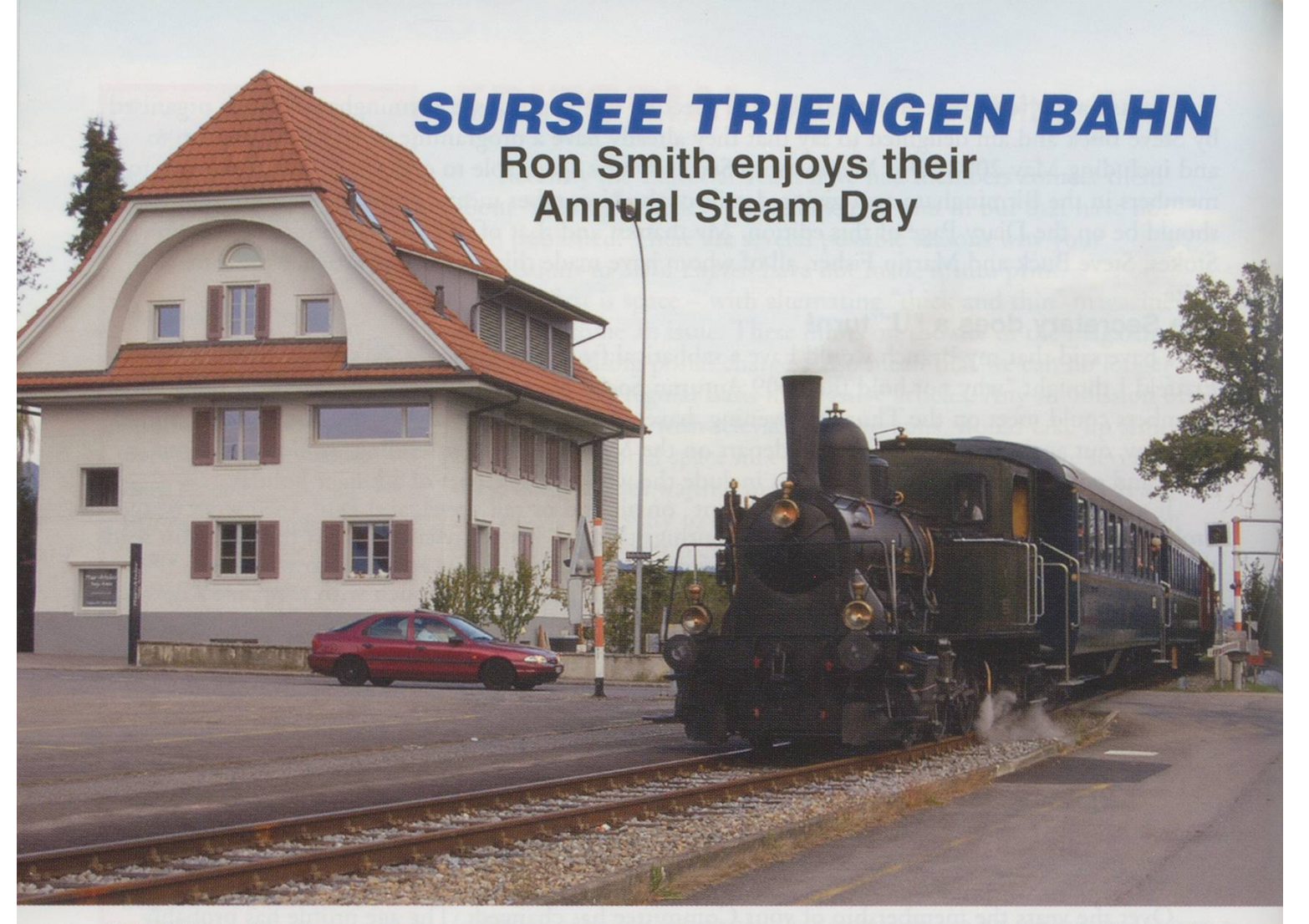
ST E3/3 No 5 at Buron

The Sursee Triengen Bahn (ST), which was described in an article in the December 2002 Swiss Express, holds an annual steam day and this was on Sunday 24th September in 2006. The line has two steam tank engines. As E3/3 No. 8522 (SLM 1913, ex SBB – this is one of the two locos converted to electric operation in 1942/43) was in the workshop under repair and in pieces, E3/3 No. 5 (SLM 1907 ex SBB 8479) was in operation with a five coach train. This was a mixture of both bogie and 6-wheeled stock, all maintained to a very high standard. The terminus station at Triengen, along with the intermediate ones at Büron and Geuensee, are really charming and Germanic. Triengen was "en fete" with the station buffet open, whilst the forecourt was busy with a North American-style Tepee sheltering the live music performers, a carousel for the children, plus lots of