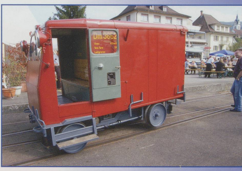
ST Draisine Dm 3652 jacked up and being turned around

There was quite an intensive service with six return trips being made, the first leaving Triengen at 08.55 and taking 23 minutes to Sursee, inclusive of the two intermediate stops. At Sursee, work was well in hand in the creation of the new fourth platform for the Luzern S-Bahn network. The ST train blasted up a short steep curve onto the main line formation, then ran right through the station on the main line and into the