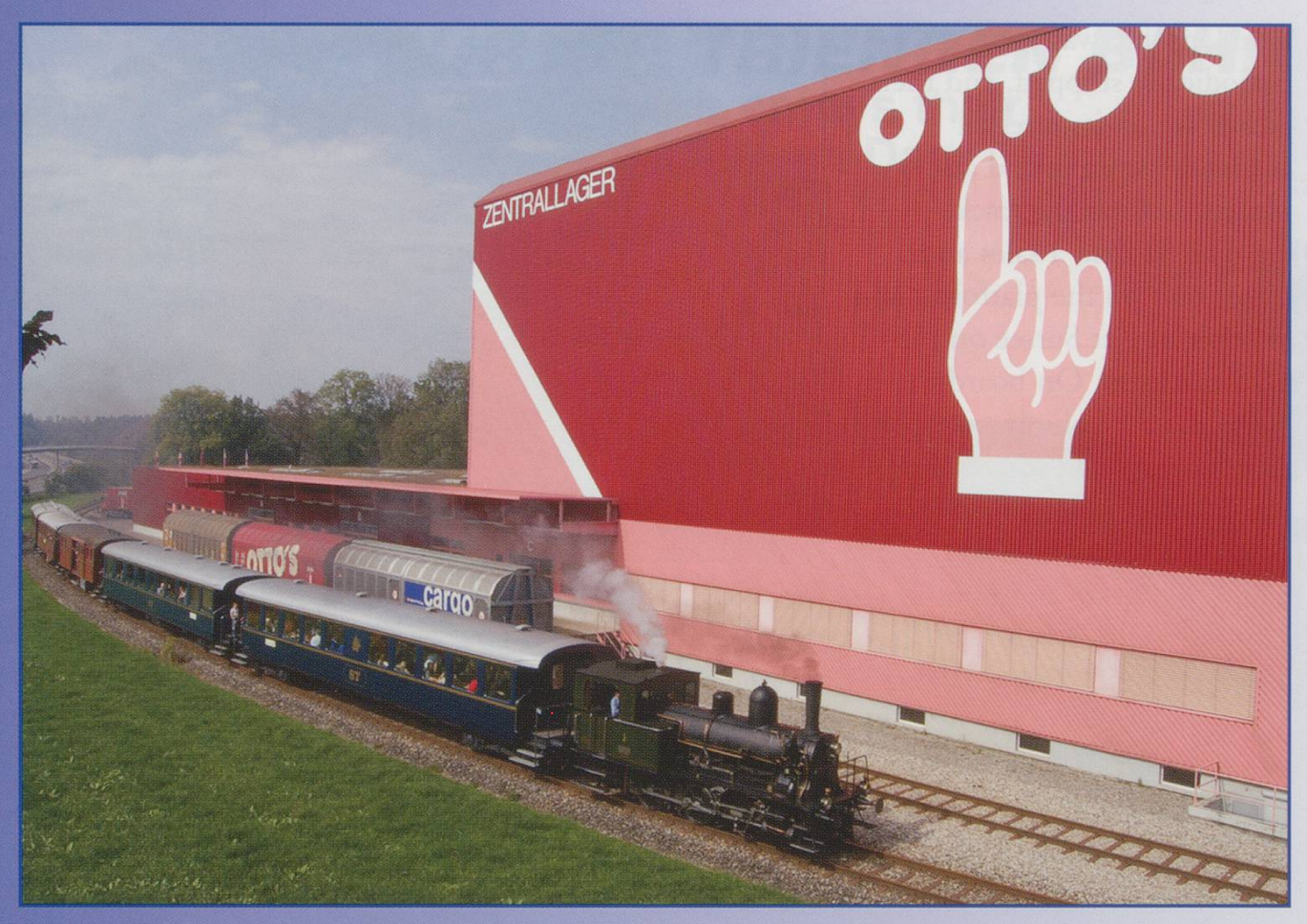
ST E3/3 No 5 passes Otto's warehouse