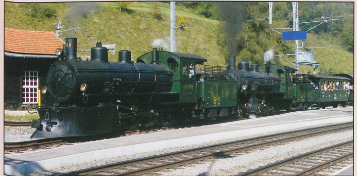
Double headed RhB steam special heads for Landquart after reversal and loco turning at Filisur, 16.9.07.