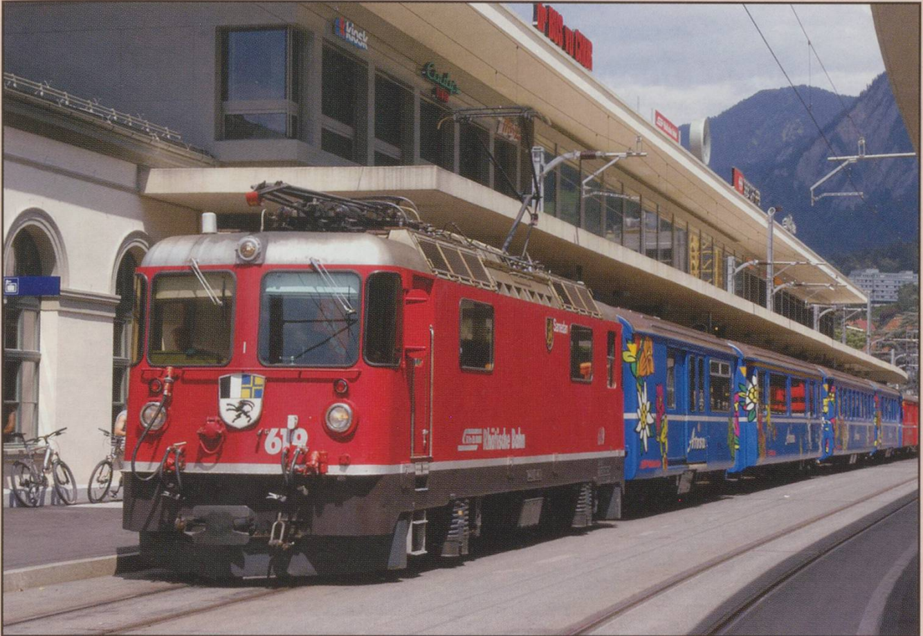
RhB Ge 4/4 n 619 'Samedan' leaving the new Chur station with the Arosa Express, 23.7.07.