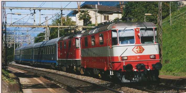
The Northbound Cisalpino "Cinque Terre" headed by Re4/4 11109 and another Re4/4 at Lugano Paradiso, 30.7.07.