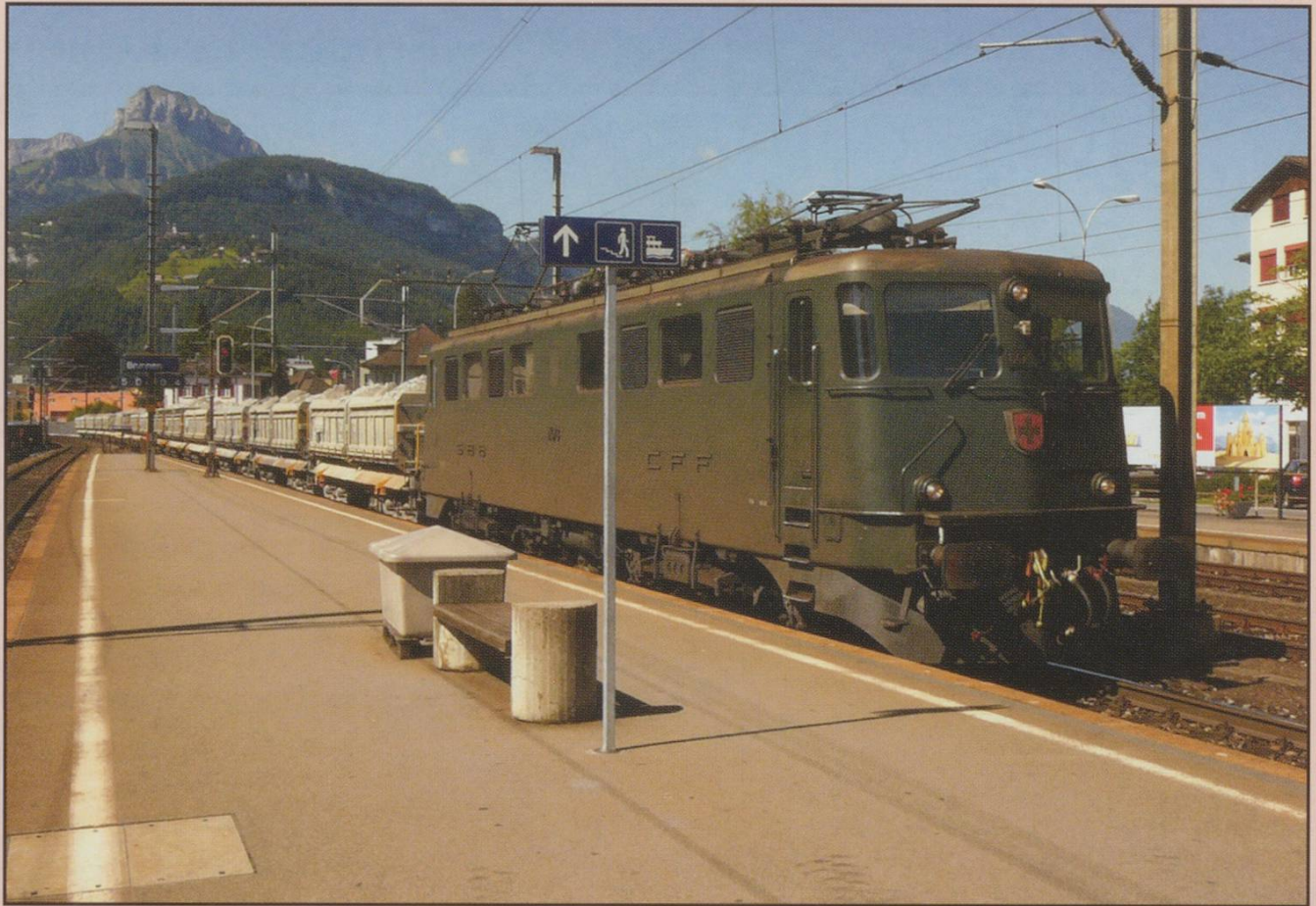
Ae6/6 No 11473 passes through Brunnen in June 2007.