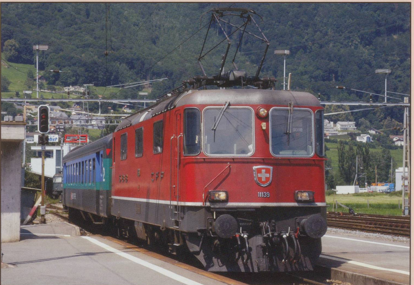
A Chur-bound Rheintal Express headed by Re4/4 ii 11139 at Sargans on 30.7.04.