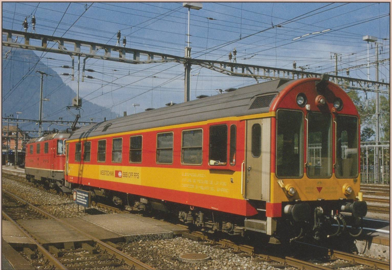
SBB 11271 with "Voiture de la mesure de la voie" X60 85 99 - 73 105 - 6 at Arth Goldau on 17.9.03.