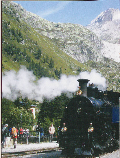
DFB No 9 arrives with its train at Gletsch with the Rhone Glacier in the background on 7.9.07.