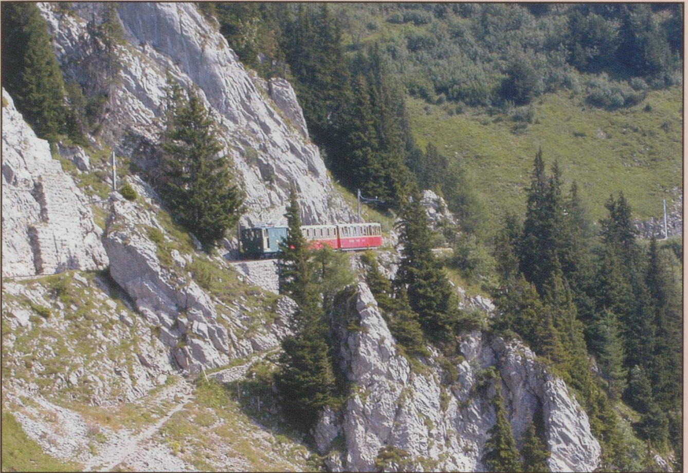
Going up the Schynige Platte line in August 2002.