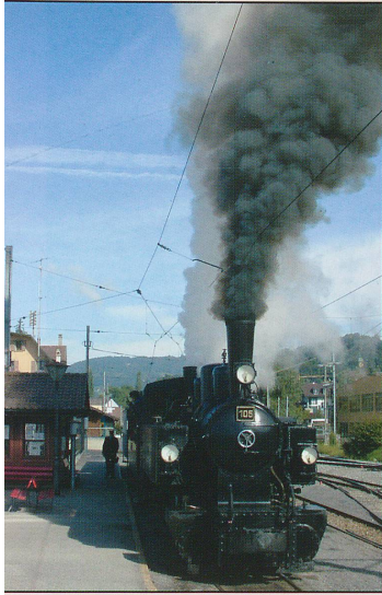
Blonay-Chamby Museum Railway G 2x3/3 105 at Blonay, 7.9.07.