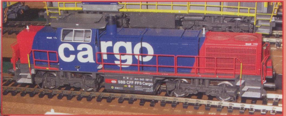
RIGHT: Mehano: SBBC Am 4/4 843.091