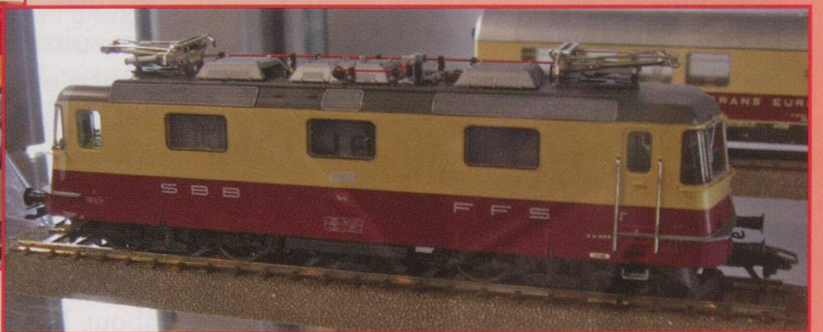
RIGHT: Mä/Trix: SBB Re 4/411 in TEE livery