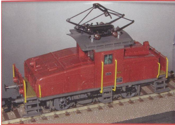
ABOVE: Mä/Trix: SBB Ee 3/3 16367