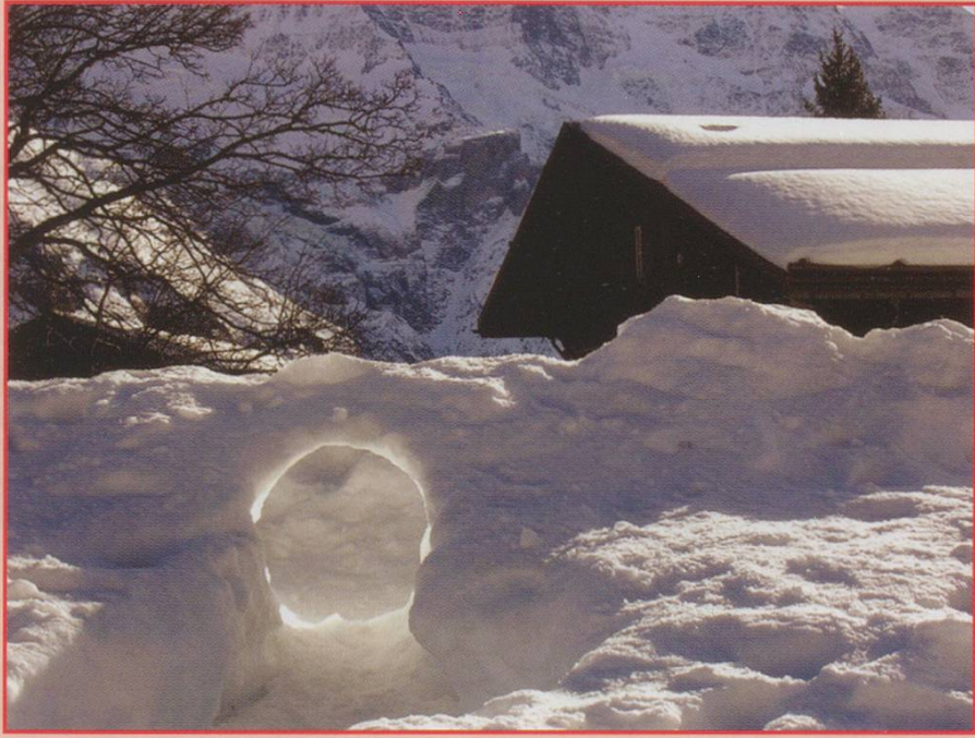
Heather Hall -SCENIC Halo Switzerland v1