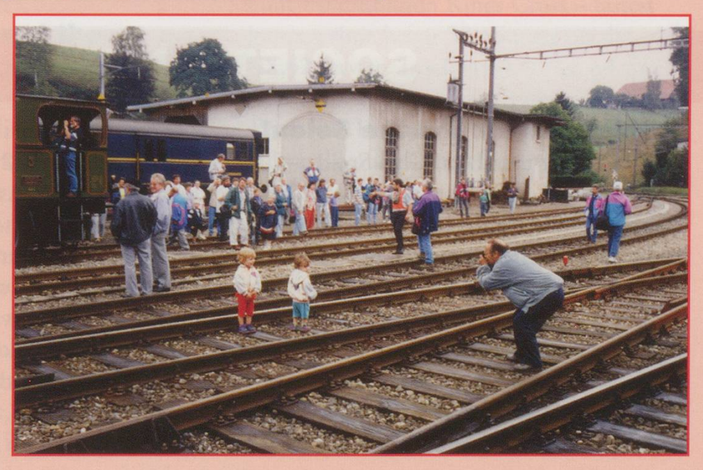
Alan Pike -HUMOROUS Quick before the HSE arrives