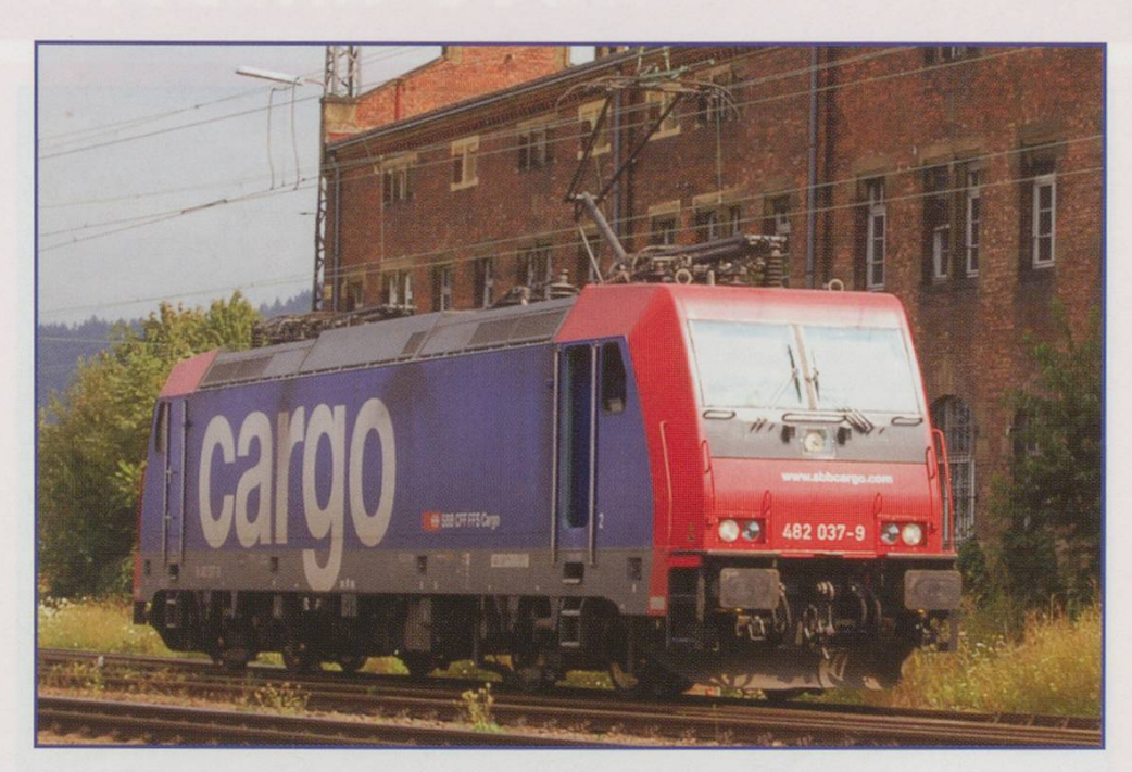
Loco Re482037-9 is seen in Friburg-im-Brisgau, Germany on 30th August 2007.

The Swiss Government subsidise this service as part of the programme to reduce the number of heavy vehicles transiting Switzerland. When the service started in 2001 the subsidy was SFr700/ truck; in 2006 this had reduced to SFr370/ truck. The subsidy is a fixed amount, so that as more tucks are carried, the amount per vehicle is less.