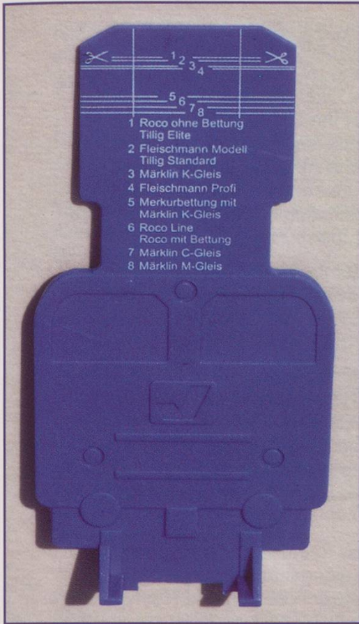
Viessmann height positioner for the wires

fixed in the correct position in relation to the pantograph of a locomotive. If the wire is too high the pantograph will not reach the wire, if it is too low the pantograph will push too much on the wire which will not make smooth operation of the trains. If the wire is too far from the centre line the