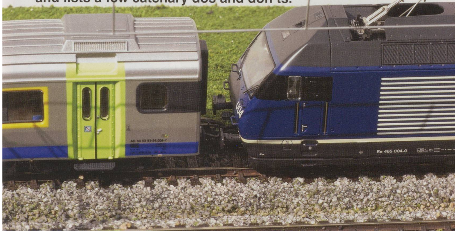
Viessmann with Roco bls class 465 loco