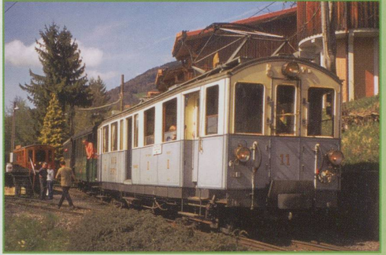
TOP RIGHT: MOB automotrice BCFe 4/4 No. 11 approaches the bifurcation at Chaulin to run onto the main line of the BC. 1 May 2008.