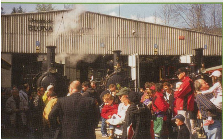
BOTTOM LEFT: A busy day at Chaulin Museum as the crowds gather to witness the synchronised whistling. 1 May 2008.