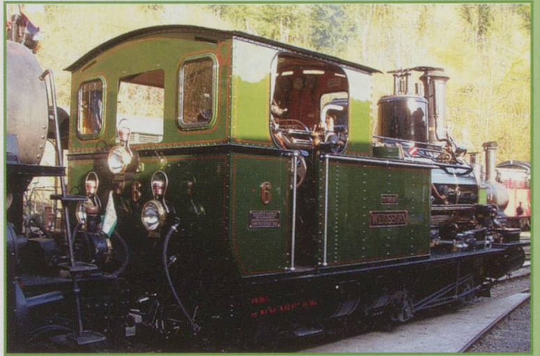
MIDDLE TOP: DFB HG2/3 No. 6 "Weisshorn" couples to sister loco BFD No. 3 for the son et lumière presentation, 3 May 2008.