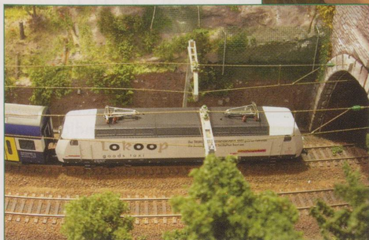
TOP LEFT: Viessmann catenary and fixing foot.