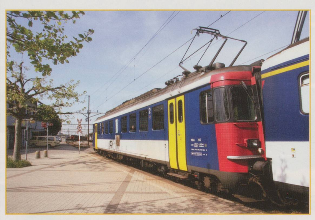
OeBB RBe 540 206 at the rear of the 10:17 to Balsthal.

Thalbrücke, the 4 km journey only takes 8 minutes. An Em4/4 diesel shunter, No. 22 (former Class 345 of DBAG(D)), was shunting near Klus. All other rolling stock seen was stabled at the Balsthal terminus. This consisted of another Class "540" unit No.205 (ex SBB 1421) and a Class "560" unit No.207 (ex SBB 560000). Also present were three De4/4 motor coaches numbered 641, 651 & 1632 (ex SBB BDe4/4 1641/1651/1632) which are used for freight haulage. All OeBB's rolling stock is second hand and the last time I saw No.651 was in 1996 when it was working the staff shuttle between Basel SBB and Muttenz.