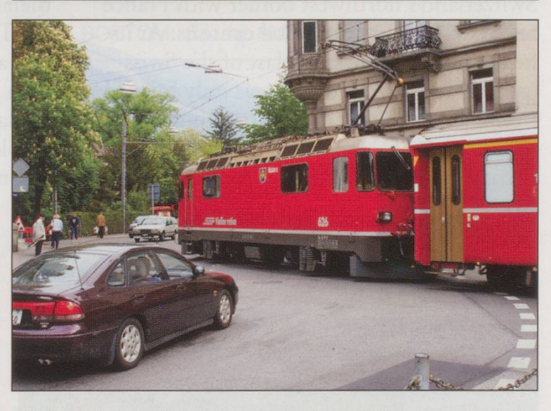
TOP: In Aigle drivers also get confused. Note the Dutch car parked on the tracks. 21/07/09.

MIDDLE: A tight squeeze as an Arosa train winds through Chur.