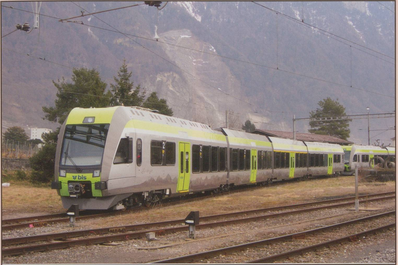
New BLS Lötschbergers at Brig.