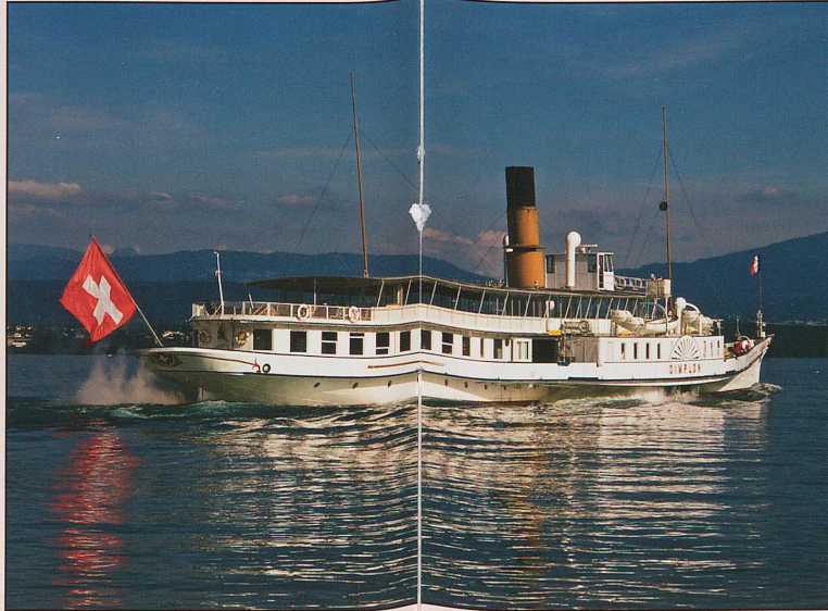
CGN "Simplon" heads across Lac Lemman from Nyon, 24/06/09. An almost perfect Swiss Flag this time.