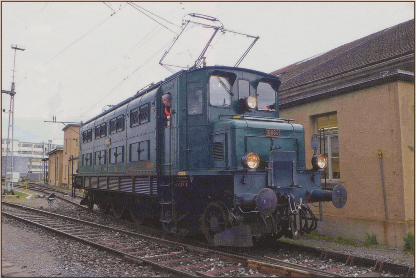
Preserved Ae 3/3 No 10664 has been moved from its normal storage until August 2009 whilst SBB renew the roof and is stored at Wetzikon in the meantime.