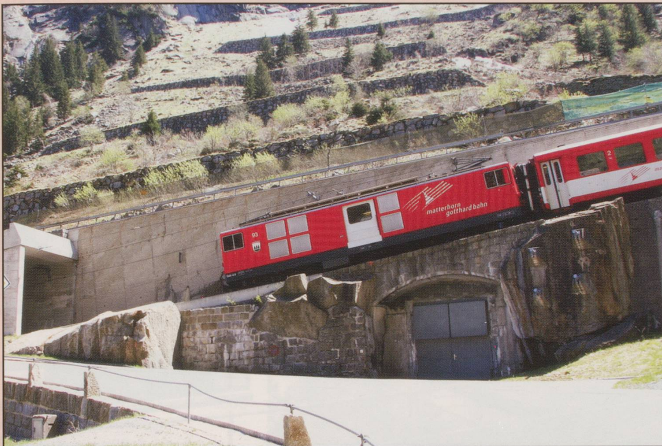
Deh4/4II 93 nearing the Reuss Bridge at Göschenen with the 13.28 from Andermatt.