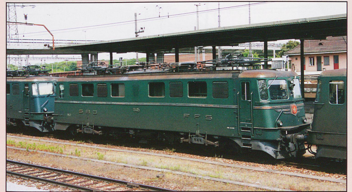
At MuttENZ on 8/5/09, Ae6/6 11405, the oldest still in traffic and in exceptional condition, stabled with 5 other operational members of the class.