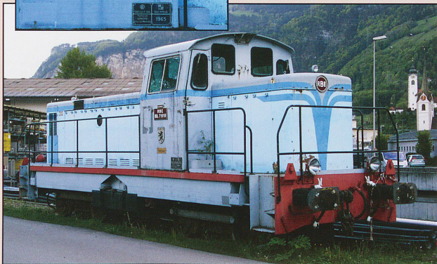
BB71010 stabled in a disused siding at Flüelen on 7/5/09. Obviously of French origin, it was used by the Rive-Bleu Express (RBE) between Le Bouveret and Evians when steam traction could not be justified.