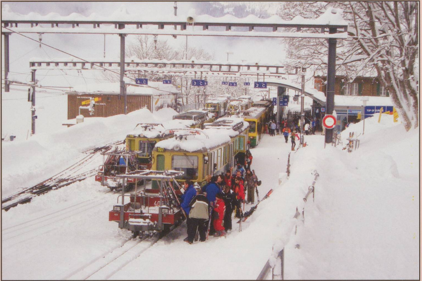
"Please stay at home unless your journey is absolutely necessary" - obviously doesn't apply in Wengen!