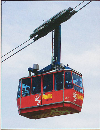
Cablecar ascends to Pilatus from Fräküntess.