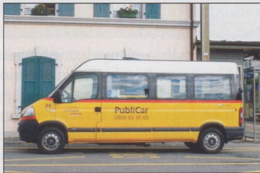
One of the PubliCar Vaud fleet waiting at Cossonay Gare in September 2008 to collect pre-booked passengers.