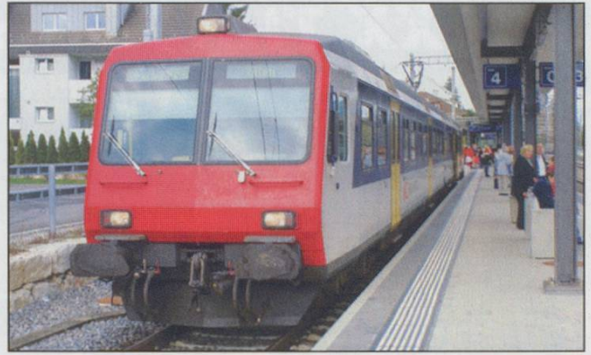
Today's S9 Sissach-Olten, Class 560, in the bay platform at Sissach, 10/2009.

Gelterkinden its own mainline station, so the SGB was closed in 1916. It was one of Switzerland's first real electric railways, so it should not be forgotten, although practically nothing remains today. Erich Buser, whose book (out of print) is legendary did not forget it and cherished some relics; and the old station is now a café. Subsequently, this summer a short stretch of rails were re-laid in the village centre as a historic marker. This being Switzerland it was 'opened' with speeches and a glass of white wine, and handshakes all round. I was invited, and told them that the SRS would be properly informed - so here you are. So now ride the S9, Sissach to Olten, and look for the many signs of Brassey's original work.