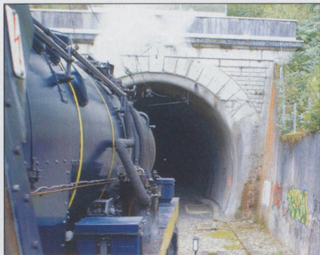
A footplate view in Oct 2009 on the DLM 2-10-0 No 52 8055, entering Brassey's 2,4 km Hauenstein Tunnel (now reduced to single track)

between February and June 1854. Brassey, the leading British railway contractor (employing some 10,000 workers at times) who was also working in France in 1854, wanted this job. His proposal abandoned the winding gear, and suggested 18.2 km of double track railway climbing high above the valley floor on a 1 in 41 gradient. He was awarded the contract in July 1854, for completion in August 1856 – this, however, was not to be. There were major differences resulting in the works being delayed, then on May 28 1857 a vertical tunnel shaft caught fire, and 63 workers were asphyxiated. A monument in Trimbach churchyard, below the south portal of the tunnel, lists their names including three British.