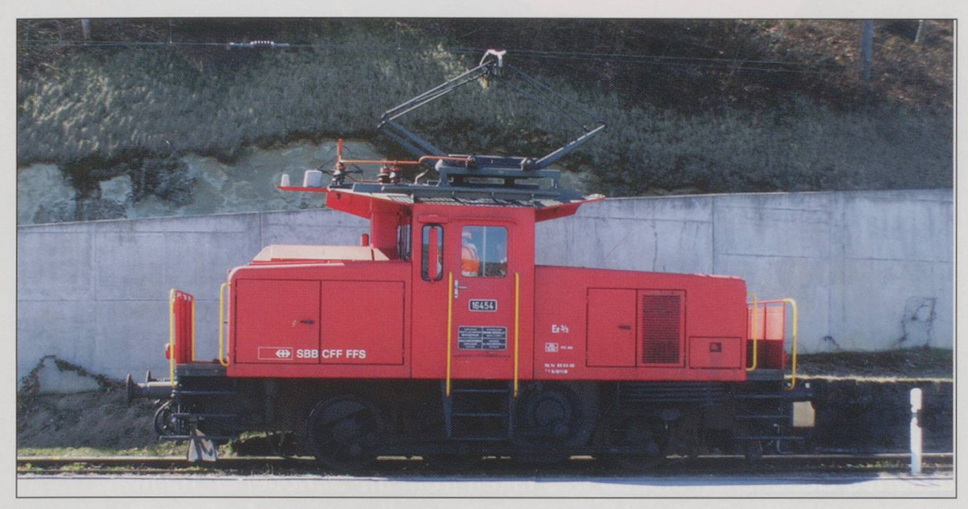
The works still justify a full-time Ee3/3 shunter seen here on the highway crossing outside the works...

run on the main line under the wires, but OK to work in a yard. The drill was to boil away until the pressure came up, go away and shunt, and then boil again. No 8521 went the way of all things but, stripped of its electrical bits, No 8522 found its way to the Sursee-Triengen-Bahn (STB) where at 103 years old it is still working. This short railway was never electrified, so photographers can get rustic images of steam at work with