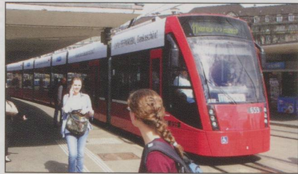
On 25/3/ 2010, I was surprised to see this red Bern "Combino" No. 659 in front of Zürich Hauptbahnhof ...

At the symposium, we were shown in detail how everything works, including a visit to a signalling centre to show how a modern dispatcher operates and how the automated connection system works. For a delay of up to 3 minutes, the system automatically holds the connection, informs the driver and adjusts the passenger displays. Between 4 and 10 minutes delay, the system