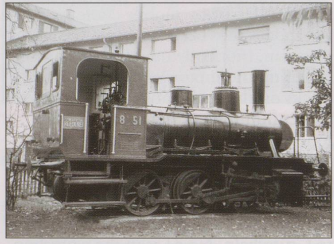
No. 8551 on its plinth in 1965.

Earlier this year the Swiss press and TV flocked to a children's playground in the Kleinhüningen harbour district of Basel. The reason was that the old 0-6-0T shunting loco No 8551 was finally going to steam again. One of a series of nine engines built by SLM in 1894 for the Nordostbahn, she served the SBB until 1935 before being sold to the Swiss Shipping Co of Basel. After shunting the harbour and warehouses until 1963 No 8551 was put on a plinth by the Seaman's Home. Forty-five years later she is surprisingly robust and complete, and has now been taken to Brugg where the Bahnpark Foundation will see her restored. Another of this series, No. 8554 currently on a plinth on the north side of Dietikon station, is also about to be restored for use on the historic Seetalbahn.