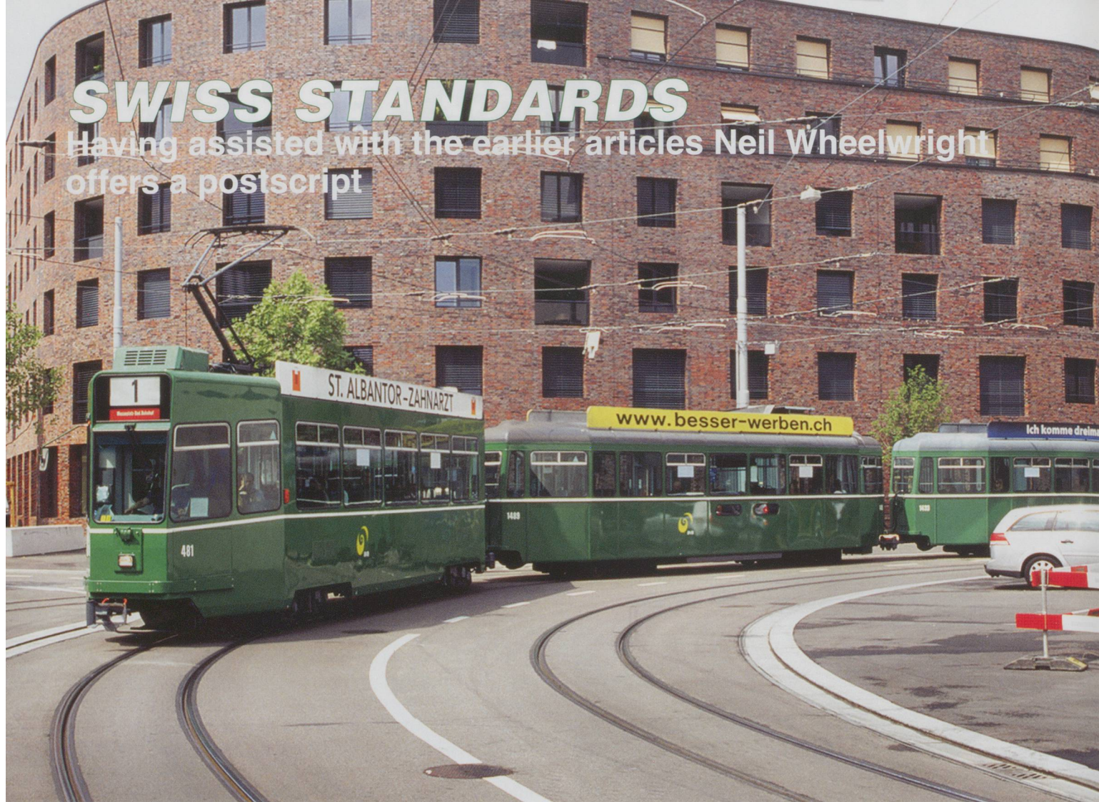
BVB 481 + Swiss Standard trailers 1489 + 1433 arr Bahnhof St Johann on a recently opened section of route.

Having assisted with the earlier articles Neil Wheelwright offers a postscript