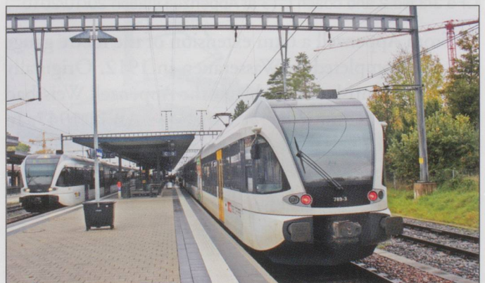
Thurbo RABe No.526 789-3 to Schaffhausen at Kreuzlingen (with No.526 790-1 to Herisau on its left) 16/10/2010.

From St Gallen to Herisau Südostbahn (SOB), trains run along what was formerly part of the Bodensee-Toggenburg-Bahn (BT) and over the Sitter viaduct. Opened in 1910, this is 99m above the floor of the river valley and is one of the tallest railway bridges in Switzerland. Many of the local services in the St Gallen area are now operated by Turbo electrical multiple units of the class RABe 526.7 with their extremely colourful and modern interiors.