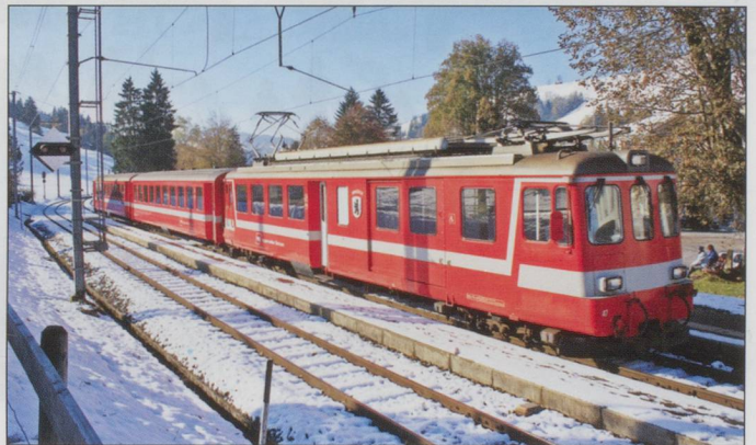
BDe 4/4 No.47, B244 and ABt No.146 arriving at Jakobsbad after fresh snowfall with the 14.47 Gossau – Wasserauen on 26/10/2010.