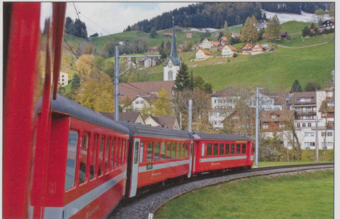
ABt No.141, B247, B236 and BDe 4/4 No.41 with the 10.33 Appenzell – Gossau on the tight curve approaching Urnäsch on 21/10/2010.

BDeh 3/6 No.25 at Rorschach Hafen having arrived at 15.28 from Heiden on 23/10/2010.