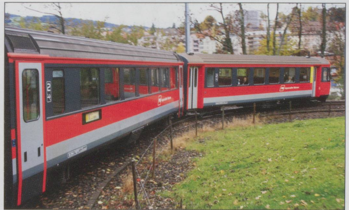
ABt No.113, B294 (and BDeh 4/4 No.11) negotiating the tightly curved approach to St Gallen on the rack section from Riethüsi with the 12.38 from Appenzell on 24/10/2010.