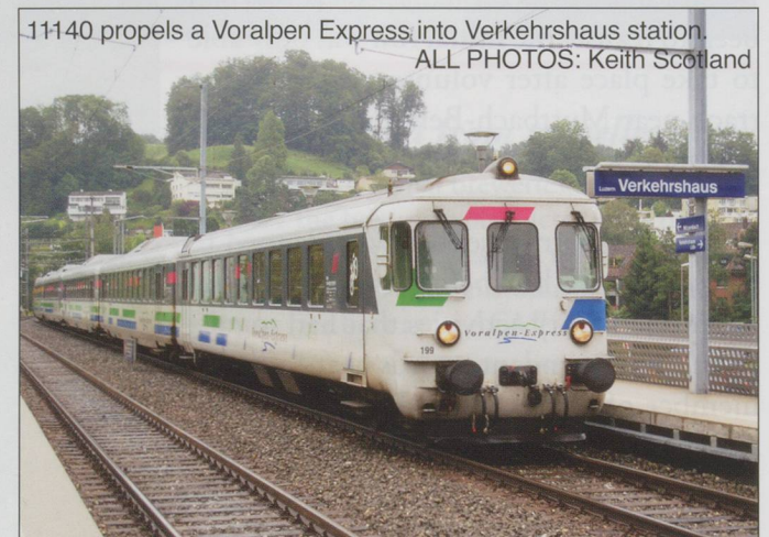
11140 propels a Voralpen Express into Verkehrshaus station.