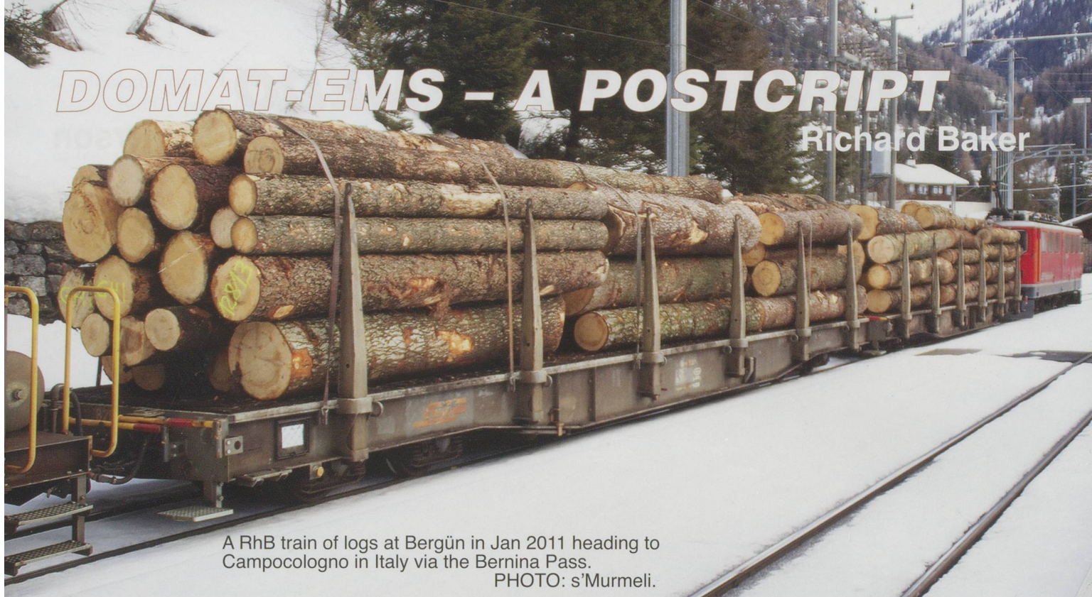
A RhB train of logs at Bergün in Jan 2011 heading to Campocologno in Italy via the Bernina Pass.