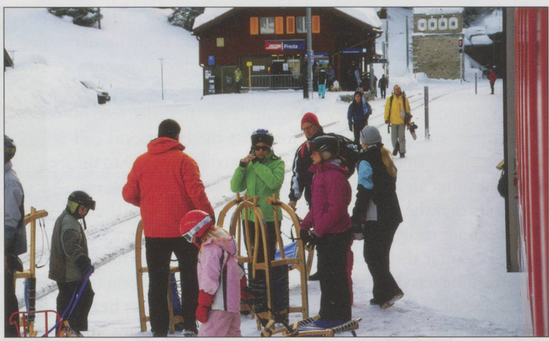
Having taken the train to Preda, the sledging enthusiasts of all ages prepare to slide back to Bergün

If you have a chance, visit Bergün in winter and ride the sledge run. It's quite (well, fairly) safe. But best of all is to take the camera, be at the back of the crowd, and stop on the way down to wait for trains on the famous viaducts. Visiting the RhB never tires. I have ridden over most of it on the footplate and there are still steam trains with 2-8-0s Nos 107 and 108. There is the feeling of a real railway, with 12-car expresses;