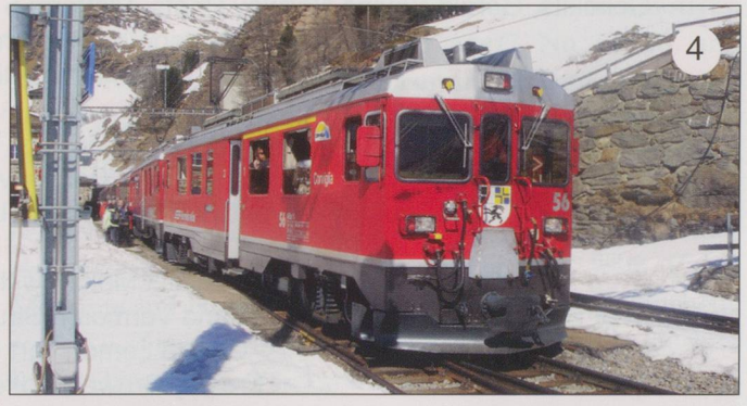
1. Ge4/4<sup>1</sup> 605 in the new platform at Bergün with the Schlittelzug in December 2010.