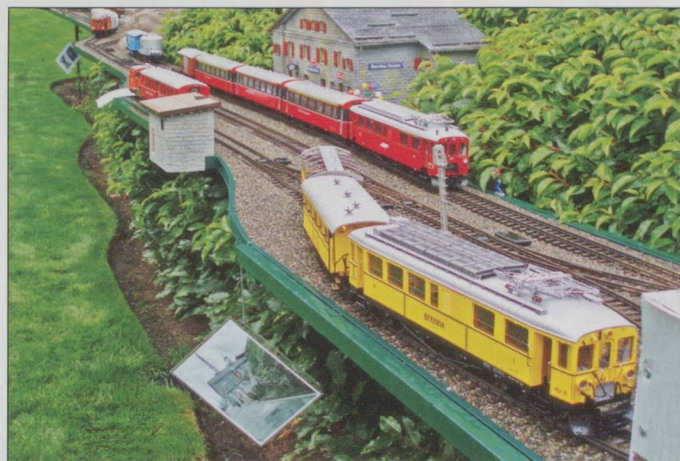
ABOVE: Train activity at Ospizio Bernina. This photo was taken at the time of the National Garden Railway Convention in August 2010. TOP LEFT: View of complete outer loop of the railway which entails St. Niklaus and Ospizio Bernina. BOTTOM LEFT: Track plan of St Niklaus station area. The track is supported by a metal platform, 38 inches above ground.