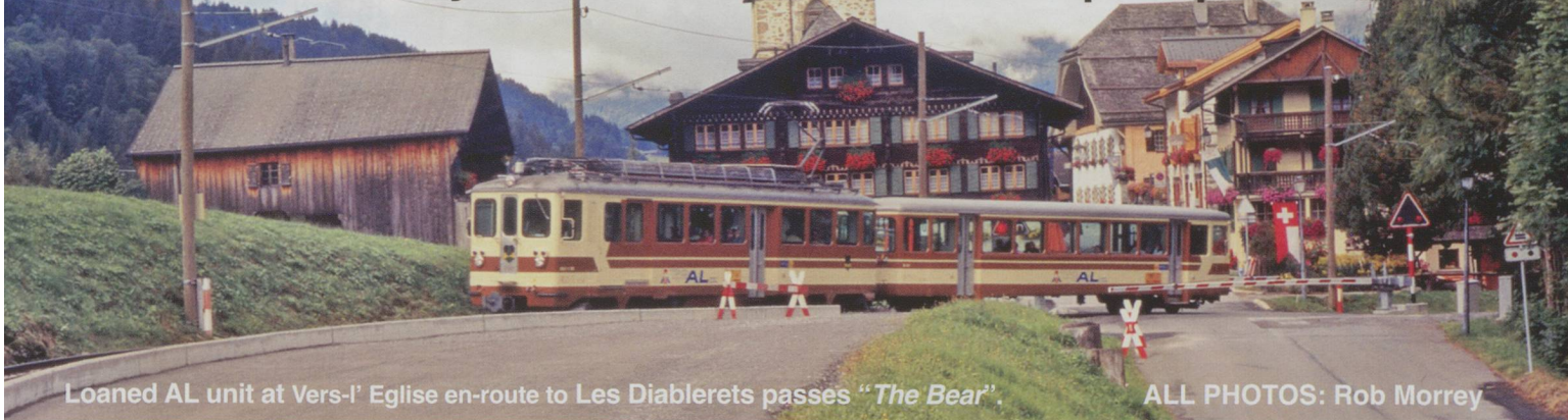
Loaned AL unit at Vers-l' Eglise en-route to Les Diablerets passes “The Bear”