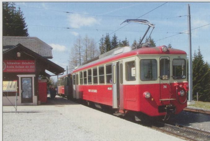
ABOVE: CEV BDeh2/4 No 74 waits at the Les Pléiades terminus on 02/05/2008.