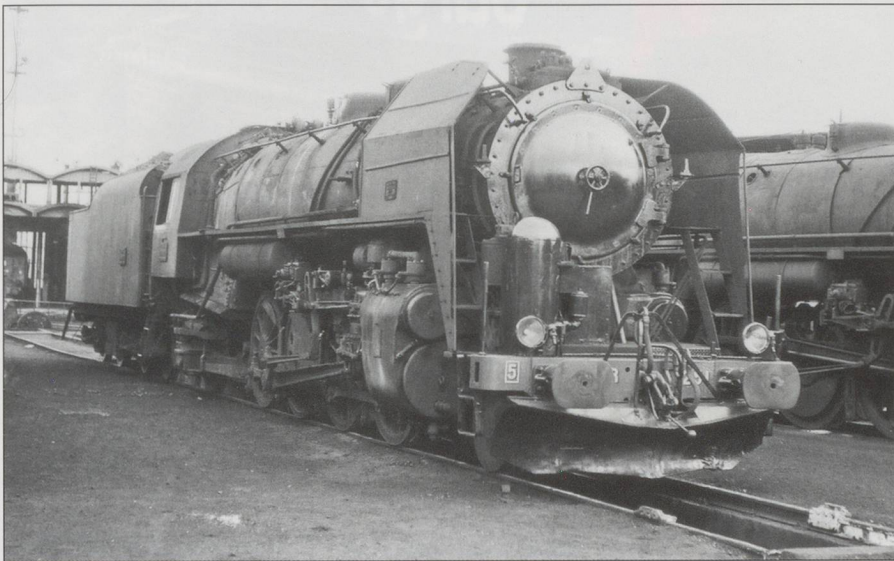
Sister locomotive 141R 251 at Dole shed, in the 1960's served the Belfort and Pontarlierservices.