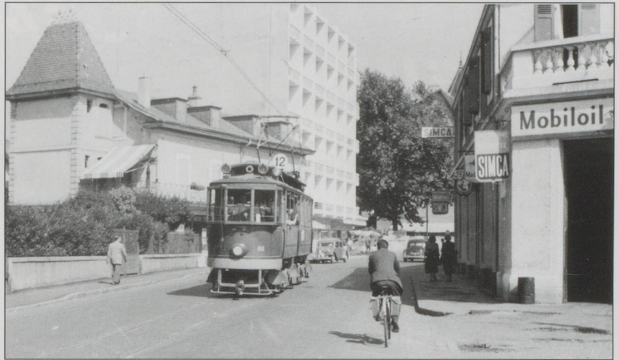
SWS/Schlieren car No. 86 in Rue de Genève, Annemasse in September 1955. Note the delightful period French cars in the background including a 'Maigret' Citroën Traction Avant.

Although no tram routes have yet been reopened across the border, Ferney – Gex