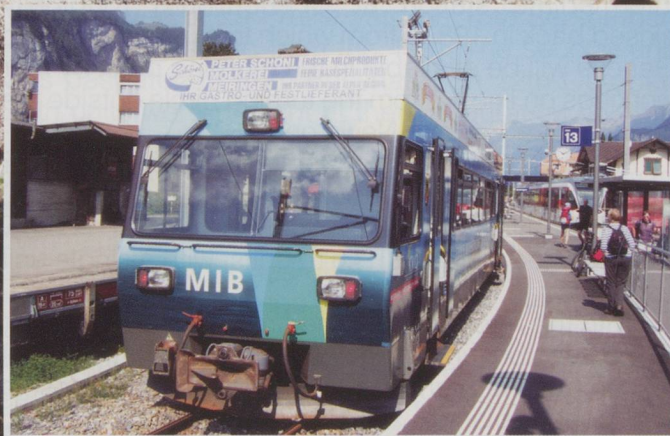
MAIN PHOTO: The garden layout. ABOVE LEFT: The Landgastof Tannler. ABOVE RIGHT: The MIB shuttle at its new platform in Meiringen.