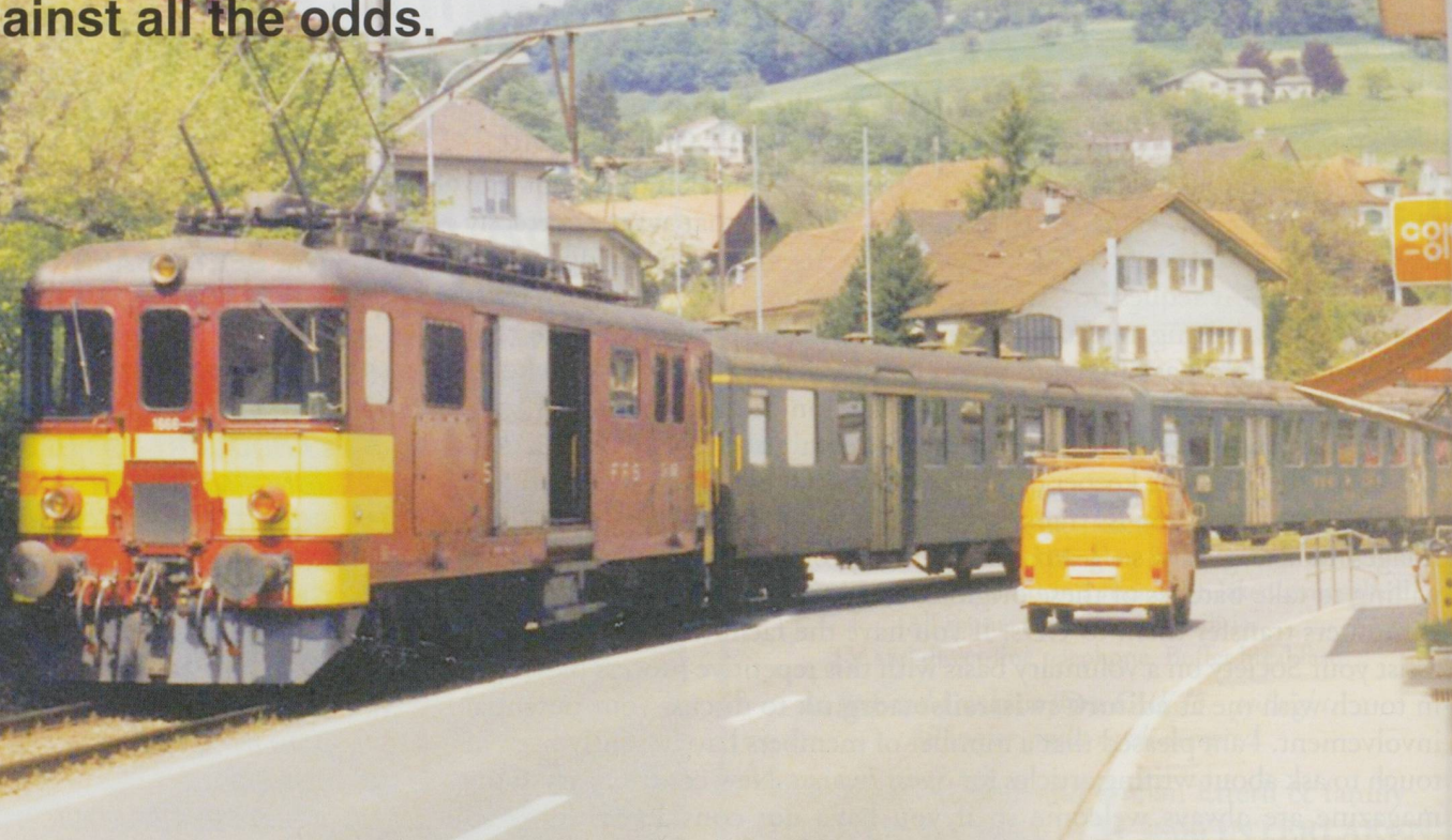
A motor luggage van with train at Mosen in 1987.