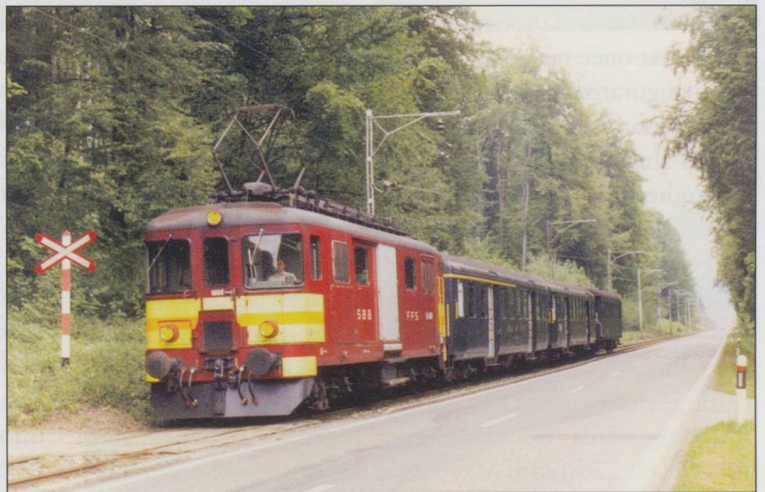
TOP: Seetalbahn 1666 at Mosen in 1987.