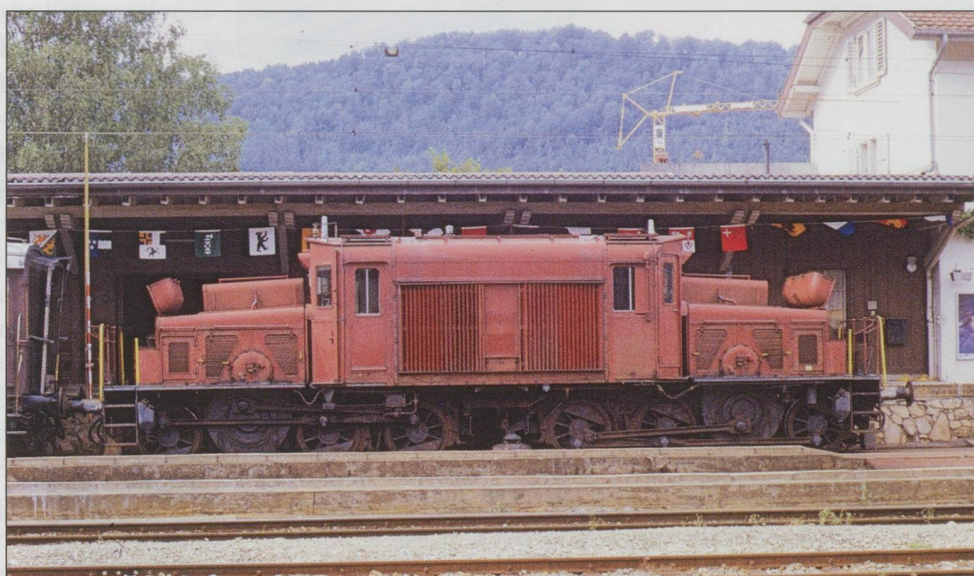
Seetalbahn De6/6 No. 15301 Crocodile on exhibition at Balsthal in September 1995.

The Seetalbahn was difficult to work; sharp curves; ruling gradients of 1 in 28 (1 in 26 on the abandoned Beromünster section); limited clearances; and weak foundations (there were no major works, though a 628m tunnel adorns the new southern end) have always dictated operational needs. When the SBB re-electricified the line it replaced the original rolling stock, and it settled down to decades of De 4/4 rail motor coach operation and light, open-platform passenger cars, although heavier railcars did work at times. They all carried garish yellow stripes to try to improve visibility. One custom-built innovation of 1926 was the De 6/6 'mini-crocodiles' Nos.15301 – 15303 used to haul freight and passenger trains until withdrawn in 1983. No.15301 survives at Balsthal. The Beromünster section had some freight traffic that later required regular use of Ae6/6 locomotives. Substantial freight is still worked out of Hochdorf, where in late 2011 an Ee3/3 was stationed, with two daily freights to Emmenbrücke scheduled.