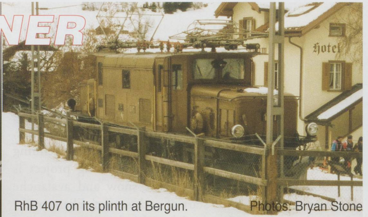
RhB 407 on its plinth at Bergun.