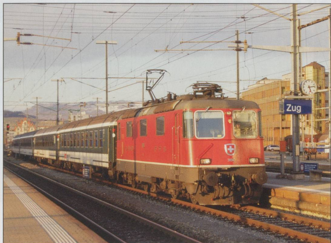
11196 entering Zug with Bpm 51 coaches.

SBB have announced that they will construct a new container terminal in Basler Rheinhafen. This is to have the capacity for an expected doubling of container traffic by 2030. The new container terminal will be connected to the existing ones.