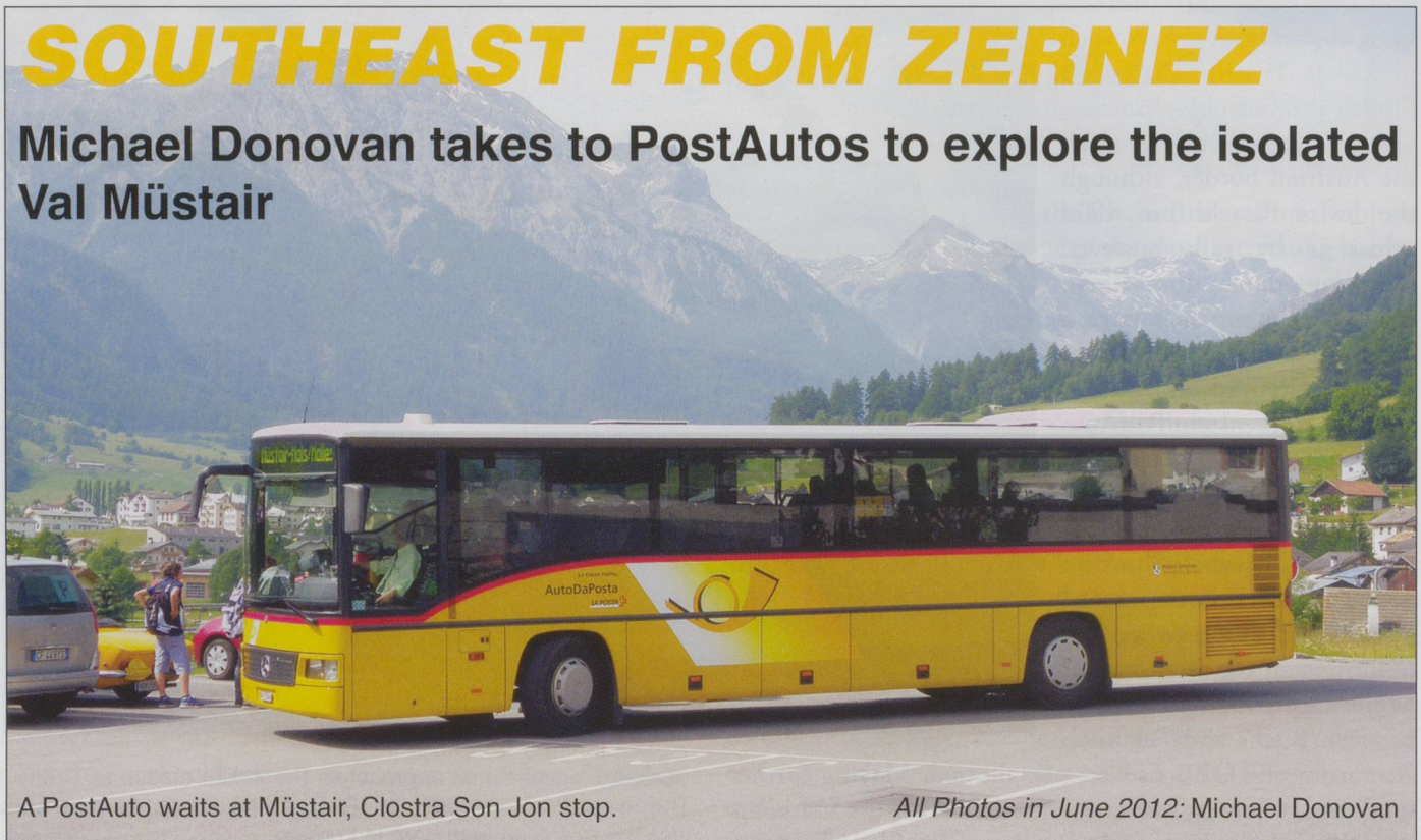
A PostAuto waits at Müstair, Clostra Son Jon stop.