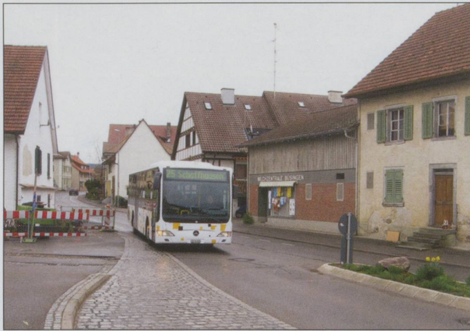
A Schaffhausen bus in Busingen, Germany, in April 2012.

opportunity in high summer to travel at half-fare on a twice-daily PostAuto through the Swiss border at the Umbrail Pass, to its Italian terminus on the Pso dello Stelvio at 2757m high. Also from Zernez the Swiss Pass is valid on the PostAuto to Livigno in Italy, where in the summer you can connect with a PostAuto to Ospizio Bernina and down to Pontresina. Now to what is probably my favourite border crossing, as the southern terminus of the RhB's Bernina line at Tirano is in