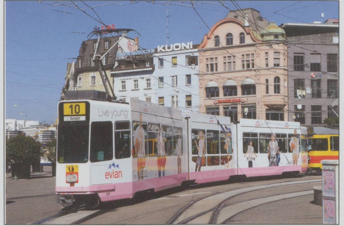
'Live Young' is the slogan that I assume relates to drinking Evian. If only it was that simple, I ask! BLT Class Be 4/8 247 was leaving Bahnhof SBB on a Route 10 working to Dornach.

A classic combination in prestige condition comprised BVB Be 4/4 No. 457 and B4 low floor trailer No. 1489, seen leaving Claraplatz on Route 15 Bruderholz.