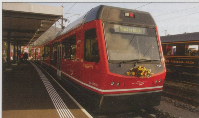
The first train waiting to leave Oensingen for Niederbipp, the 'official' opening day.

From the December timetable change trains will return to the metre-gauge line that once ran between Niederbipp and Oensingen and was closed and lifted in 1943. Major development in the area has prompted the ASm to re-lay 2km of track parallel to the SBB main line. We hope to have an article on the ASm, and the background to this project, in the March Swiss Express . The official ceremonies were on the 13th October.