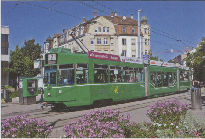
A splash of floral colour complemented the well kept tram and bus interchange at Wettsteinplatz where BVB 3-car set No. 681 was recorded with a Route 2 service to Binningen via Bahnhof SBB.

An immaculate BLT Be 4/8 No.240 in all-over white provided the lead unit on this Route 17 Wiesenplatz-Ettingen service seen entering Theaterstrasse.