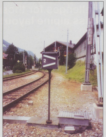
BOTTOM: End of the line at Lenk, 1994.