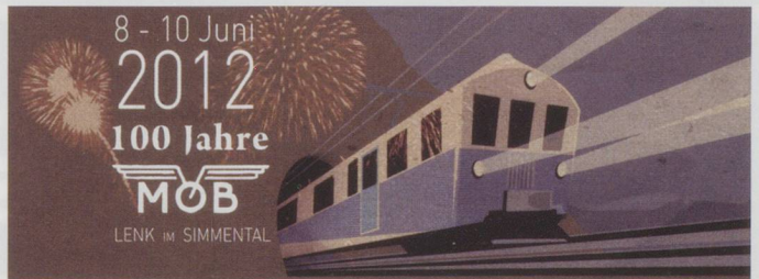
ABOVE: 100 Years of the MOB in "Lenk im Simmental"