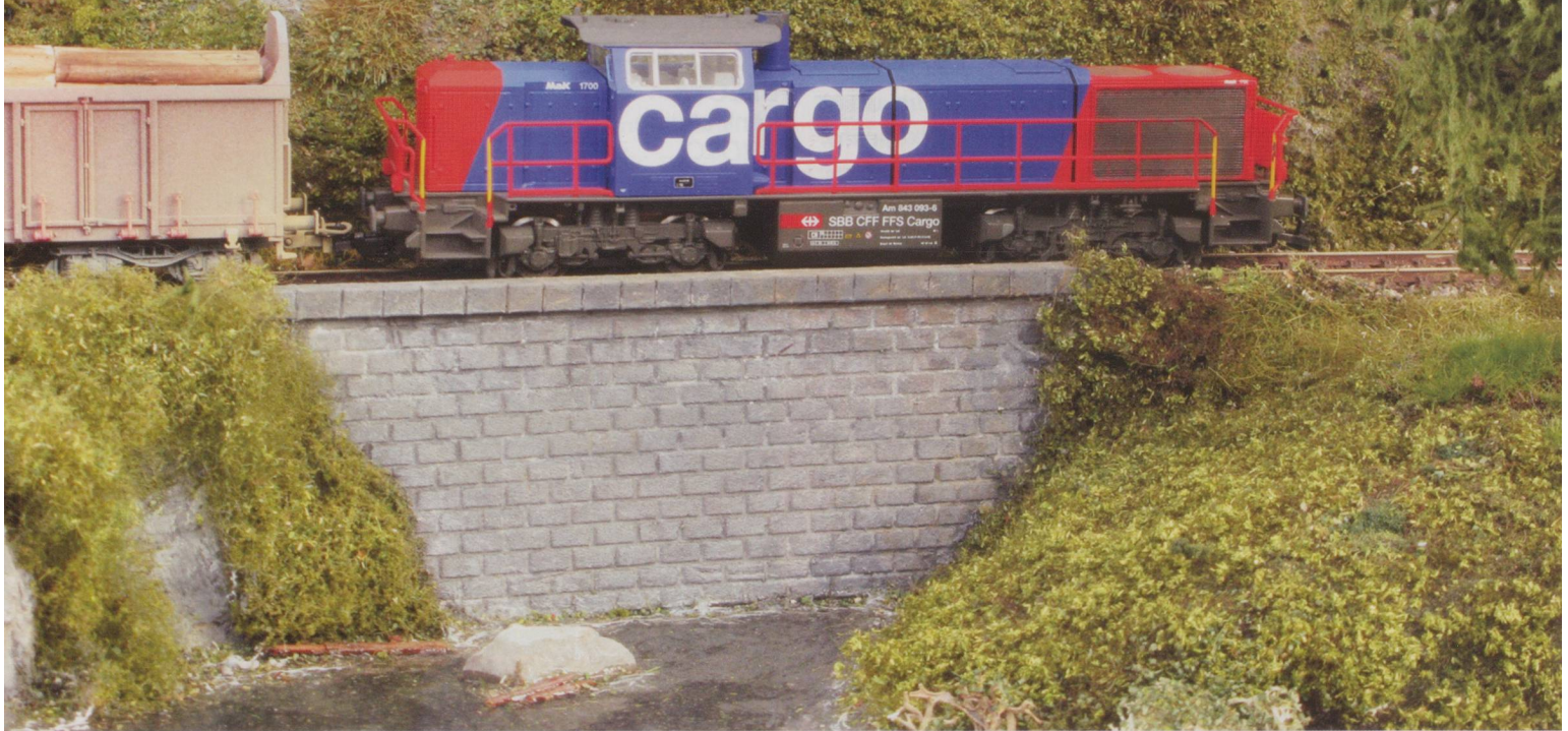
A Piko SBB Cargo Am 843 standing on top of a 2 inch raised track bed with painted and weathered Heki retaining wall.

Peter Marriott continues his series exploring the challenges for those modelling the landscape for Swiss alpine layouts.