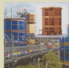
BUS1006 Hi Rise Office Block HO/OO Was £30.99 Now £19.99