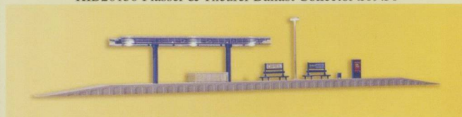
KIB49556 Modern Platform 51cm – plus Platform lights and furniture £24.95

Trade Enquiries Welcome www.ontracks.co.uk or give us a call. E&OE UK P&P : OnTracks.co.uk, Pontilas Business Park, Hereford, HR2 0AZ info@ontracks.co.uk