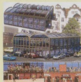
BUS1026 Sports Hall Was £25.99 Now £17.99