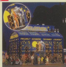
BUS1003 Amusement Arcade HO/OO Was £29.99 Now £17.99