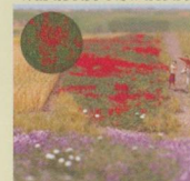
BUS7185 Poppy Field Was £7.99 Now £5.40 BUS7186 Thistle Field Was £7.99 Now £5.40