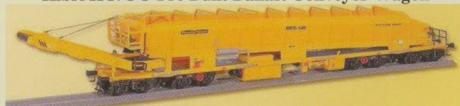
KIB26150 Plasser & Thurer Ballast Collector £69.50