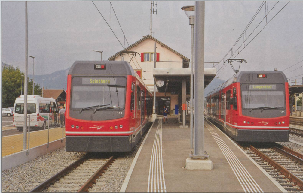
ABOVE: Asm Be 4/8 3-car units 114 'Saturn' & 111 'Jupiter' meet at Niederbipp working the R453 16:52 Langenthal-Solothurn and R454 16:48 Solothurn-Langenthal, respectively. On the left is the Bus 60 service that provided the link to Oensingen Bahnhof via Niederbipp Industrie.

renamed as the Regional Verkehr Oberaargau (RVO) later becoming the Oberaargau Solothurn Seeland Transport, when it merged with other transport operations in the area, then adopting the ASm name. Part of the group is the isolated