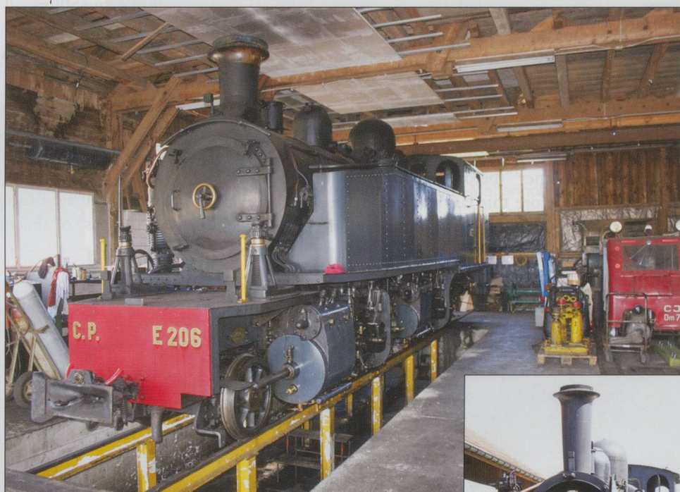
LEFT: Double Headed Steam at Pré-Petitjean.

Our trains are sometimes brought on the next bit to a sudden stop, by shots and galloping horsemen. 'Bandits' (a long way from the supposedly Wild West) can roam these woods, and passengers are often kidnapped and must be ransomed. But somehow it all ends with laughter and a glass of white wine, and we watch to make sure that running the railway is not impeded by all the excitement. Today there is no hold-up, so a quick run, past La Coombe and Pré-Petitjean, sees us into the last 15 minutes to Saignelégier where our passengers alight, happy and gritty. After another run-round, we work the empty stock back to the depot. The last job is just like home: wiping tables and seats and cleaning up, while the cars are shunted out. This lot wasn't too bad, so with any luck we're done quickly. For those on the engine, there is the disposal procedure; emptying the smokebox, a filthy job (even after 50 km it's deep in hot soot and ash); raking out the ashpan; coaling and watering; entering repairs in the log (that injector's still leaking), and, depending on what's happening tomorrow, throwing out, or cleaning and banking down the fire, before cleaning up the footplate. That too is the romance of steam. But for me, after signing off, a wash, a coffee and a bite together. It is 13.30 and 65 km in the car will soon see me home. +