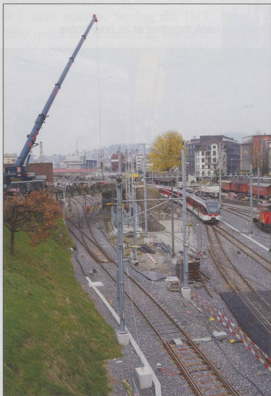
TOP: ZB-train to Engelberg crosses the Steghof-bridge. In the foreground the new railway line to the tunnel is prepared, a second track will follow in 2013.