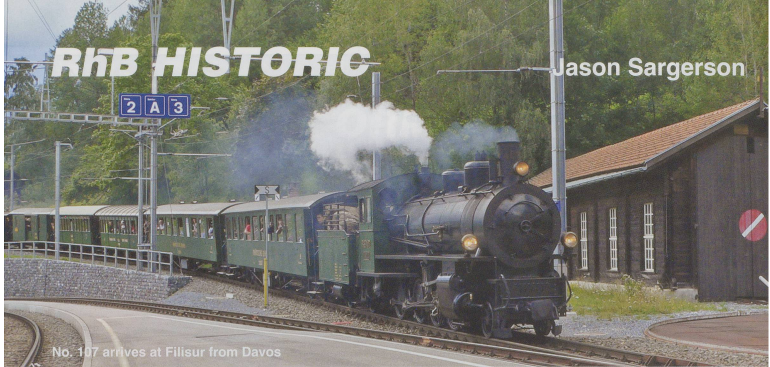
No. 107 arrives at Filisur from Davos