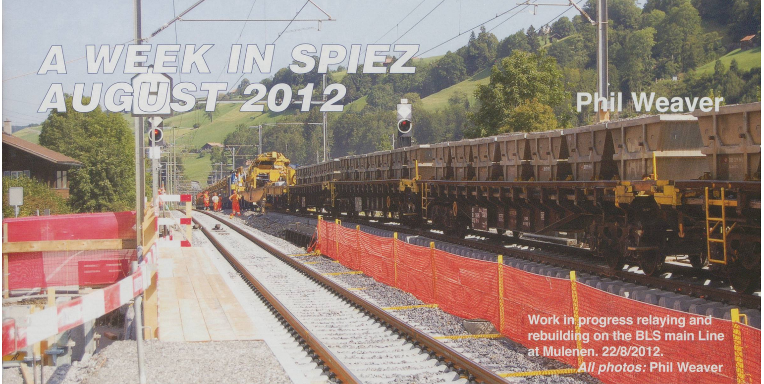
Work in progress relaying and rebuilding on the BLS main Line at Mulenen. 22/8/2012.