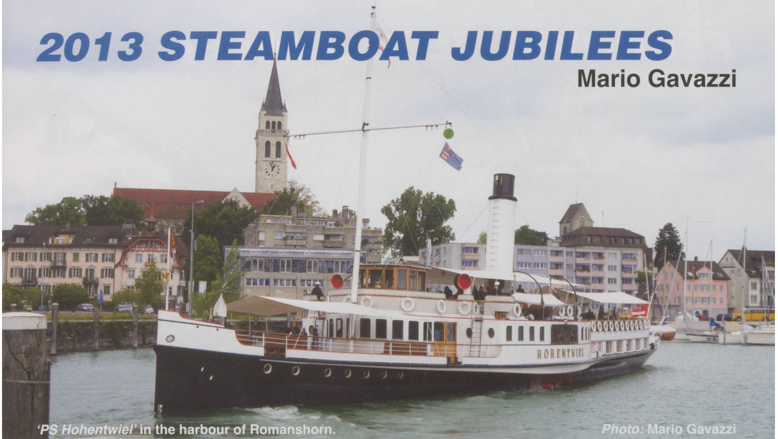
'PS Hohentwiel' in the harbour of Romanshorn.