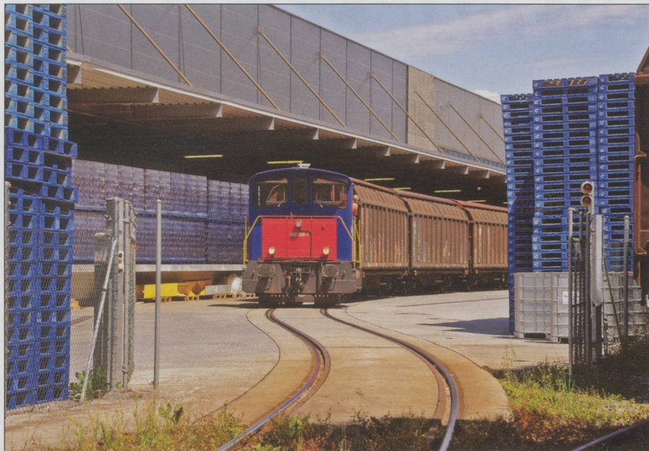
ABOVE: Having arrived with a train of empty vans, SBB Cargo Tm 232 226 was being coupled to the rake of loaded vans to be removed from the Rauch Trading AG premises at Widnau.

This lunchtime Red Bull departure from St Margrethen to Singen and beyond was recorded at Rorschach behind DB 185 094 in June 2012.