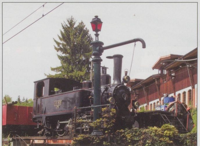
BELOW: Former Jura-Simplon G3/3 loco No. 909 replenishes its coal stocks at the bifurcation near Chaulin Museum.