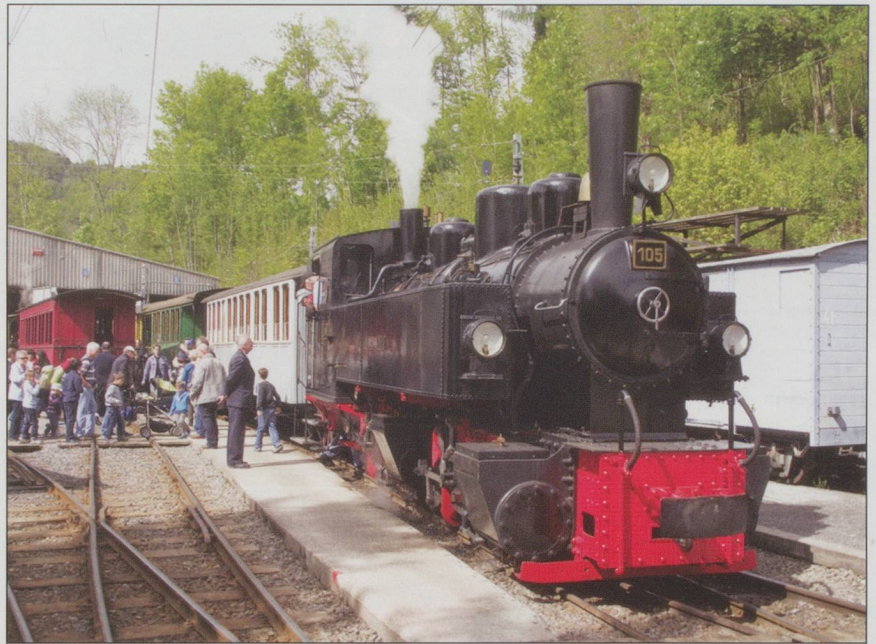
ABOVE: Ex-Zell-Todnau G2 x 2/2 105 waits to take another load of happy holidaymakers on the scenic trip to Blonay.