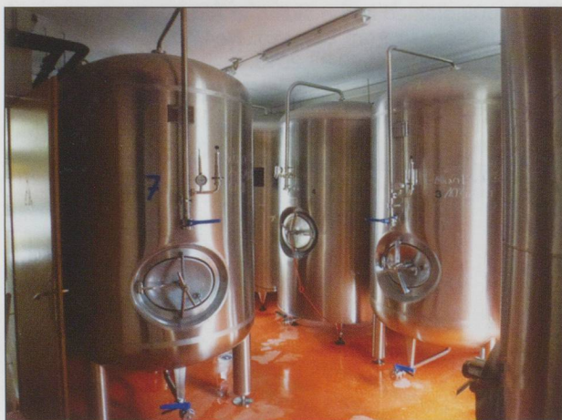
RIGHT: Some of the equipment used in the bottling section of the plant.