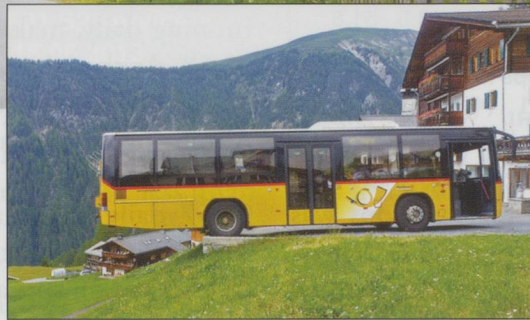
INSET: When the Postbus parks, its rear considerably overhangs the car park !!

The Monsteiner Brewery, at 1625m, is the highest brewery in Europe and is situated in its namesake village of Monstein (GR). As railways, of all types, and beer always seem to go well together it is significant that this outpost can be easily reached by using the Rhätische Bahn from Davos or Filisur alighting at Davos Glaris, NOT Davos Monstien. Confusing - yes! An hourly PostAuto service will then take you some 200m up to the village where you have just a 5min walk to the brewery, sited in what was once the village dairy. Pre-booked guided tours are available (some include transport on a vintage PostAuto), but on