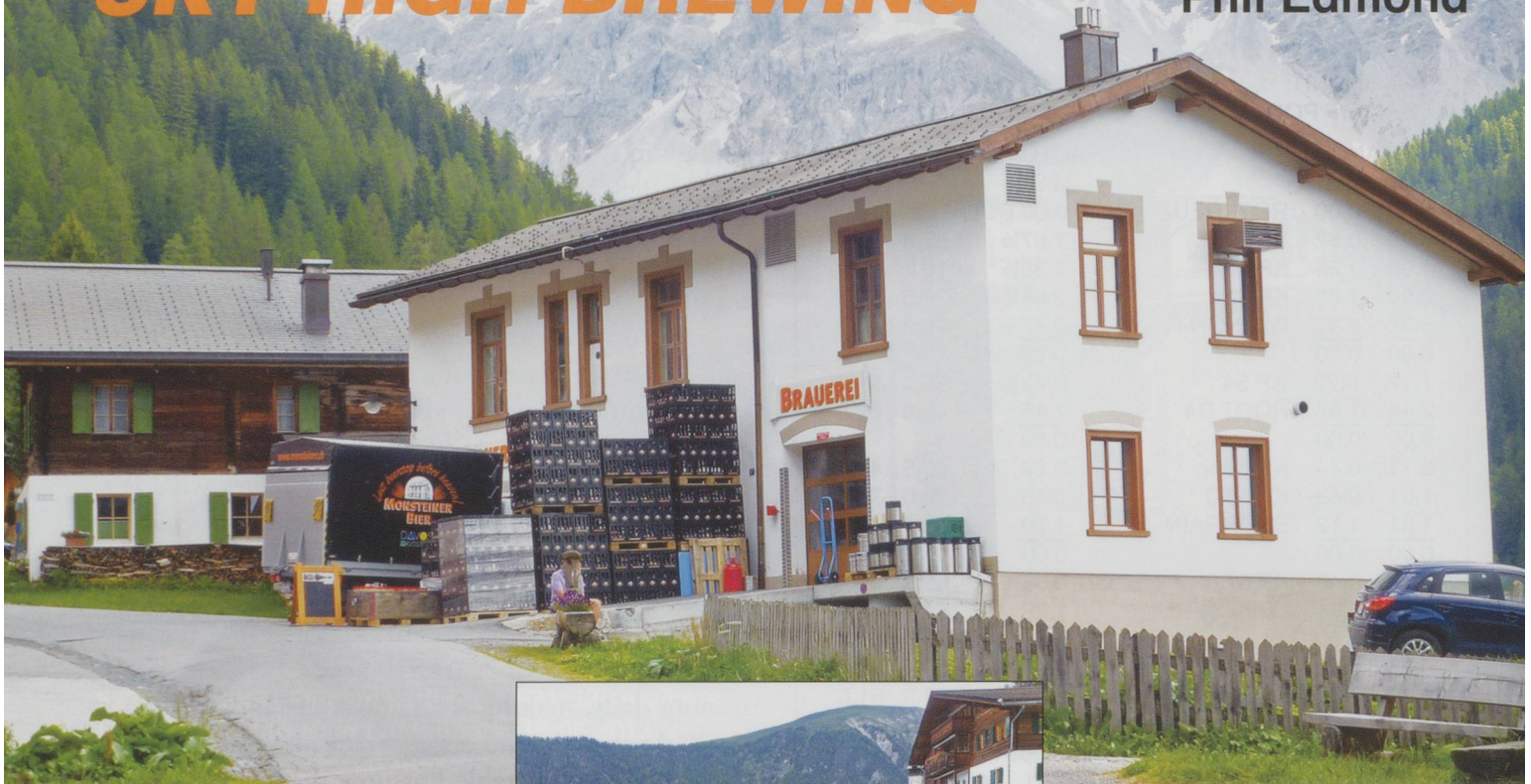
The small brewery at Davos Monstein.

The Monsteiner Brewery, at 1625m, is the highest brewery in Europe and is situated in its namesake village of Monstein (GR). As railways, of all types, and beer always seem to go well together it is significant that this outpost can be easily reached by using the Rhätische Bahn from Davos or Filisur alighting at Davos Glaris, NOT Davos Monstien. Confusing - yes! An hourly PostAuto service will then take you some 200m up to the village where you have just a 5min walk to the brewery, sited in what was once the village dairy. Pre-booked guided tours are available (some include transport on a vintage PostAuto), but on