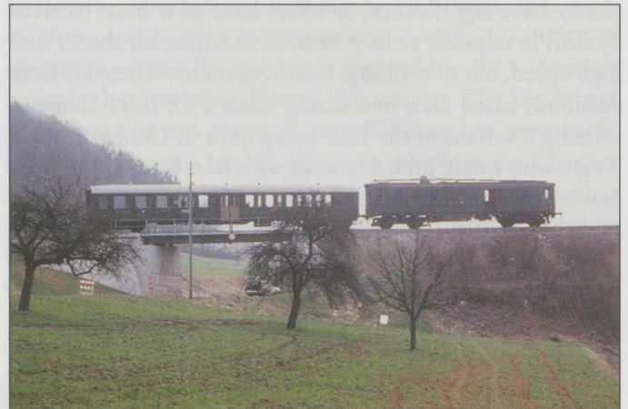
No. 1692 between Etzwilen and Singen in the 1960s.

museum railway - the SEHR, for the last 4-years. Like many enthusiast lines they may have taken-on more than they can cope with, with the result that a valuable artefact is rotting away.